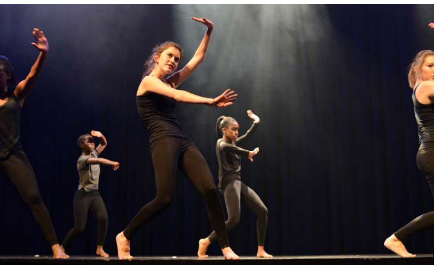
Jazz class dancers performing at Stamp Festival

The dance crew performed at the annual inter-high dance competition held at Queens High School on Tuesday 26 September. Although they performed extremely well, they did not make it through to the finals. Well done, girls.