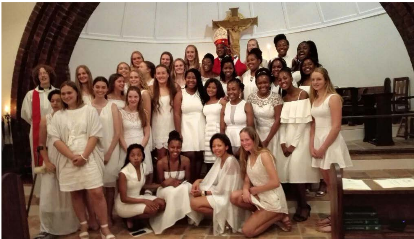
Girls who were confirmed on Tuesday 3 October