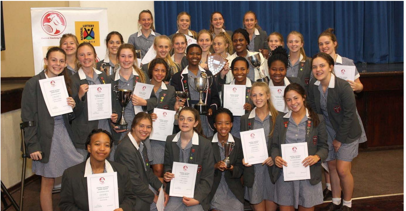
St Mary's squash results for 2017 have been outstanding and we won the Castle Aggregate Trophy (Overall winner in Gauteng Junior Squash). St Mary's also won Top Schools' Gauteng