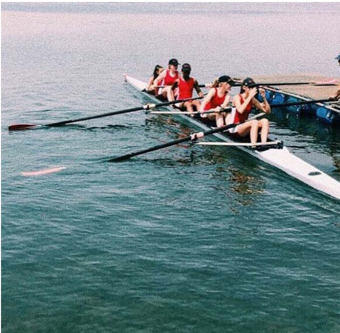
U16 four at the St Mary's regatta