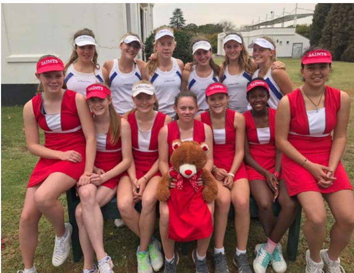
St Mary's beat St Mary's Kloof in the finals of the doubles at the Hilton/St Anne's tournament