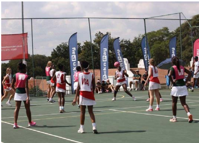
At the St Andrew's Netball Festival