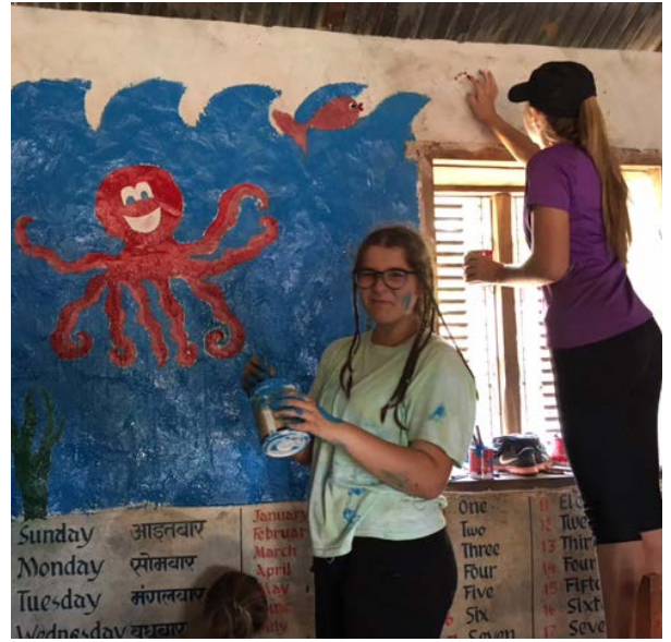
At Palpa, doing community service

The World Challenge expedition to Nepal in the April holidays brought girls together from Forms II, III and IV. They had to manage their travel and food budgets, book transport and accommodation, and navigate their way around culturally diverse and unknown places. We landed in Kathmandu, and then travelled to Pokhara by bus to embark on a five-day trek in the Himalayas, summiting Poon Hill. We stayed in tents and teahouses.