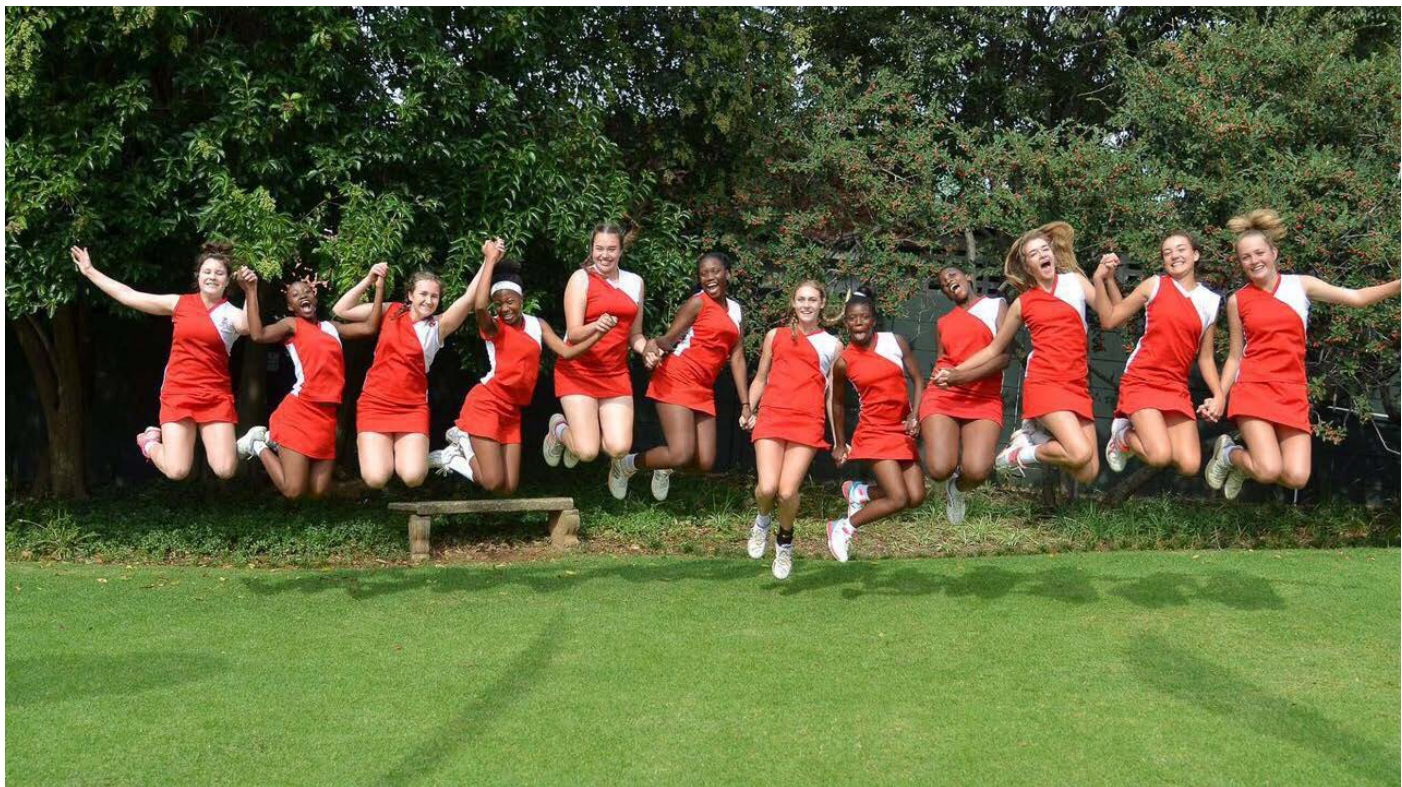
Jumping for joy after winning the plate cup!

The St Andrew's Netball Festival was a wonderful experience. We had great fun and bonded over blood, sweat, blisters, tears and laughter.