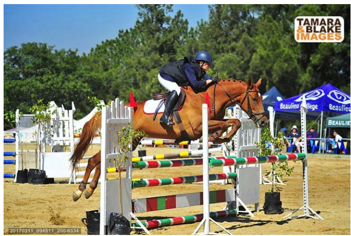
India riding Capital Azalia