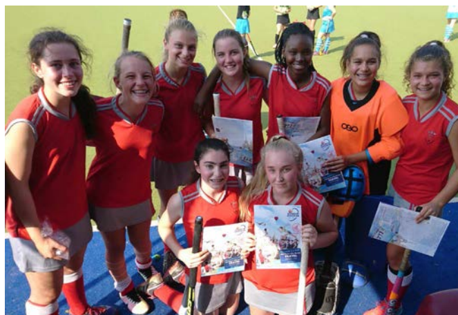
Tournament squad selection