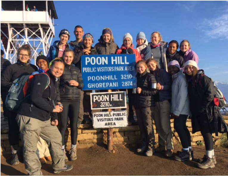
At Poon Hill