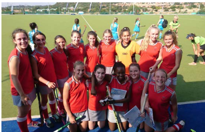
U15 A team