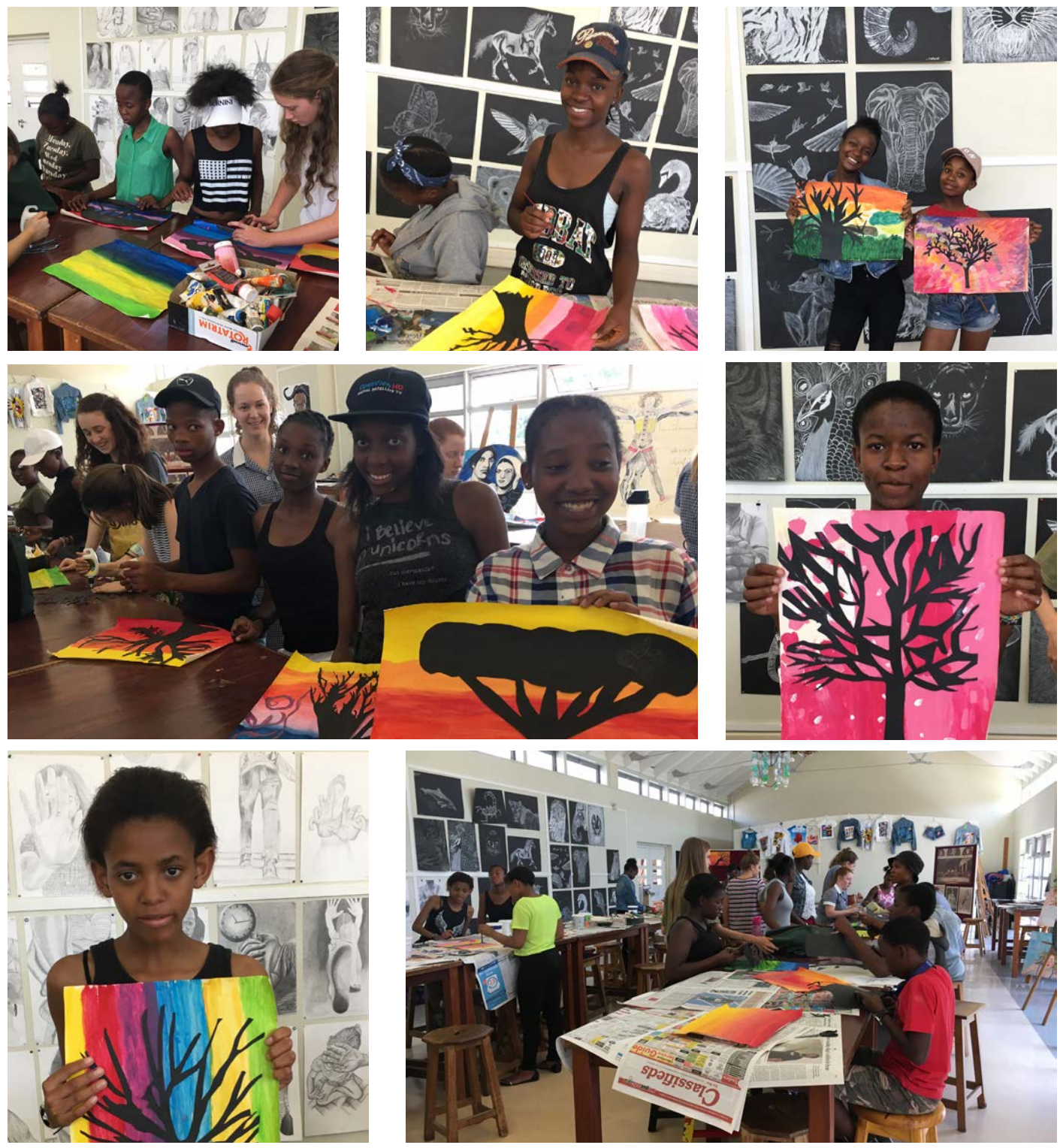
At the end of last term, St Mary's hosted an Ikusasa Lethu enrichment day, which was a roaring success. The Visual Arts department hosted a workshop, during which St Mary's girls worked with students to create black silhouettes of trees against colourful backgrounds representing sunsets. There was much creativity exhibited and the vibrant works turned out beautifully. The girls are looking forward to more events such as this one, as new friends were made and much fun was had.