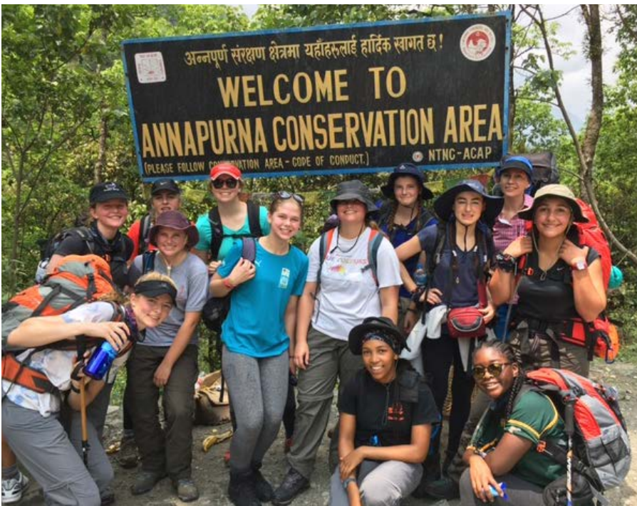
The girls who experienced the World Challenge expedition to Nepal

determine access to future success. Such skills and strengths are developed and gained slowly over a period of time and, contrary to the general trend of today, instant gratification.