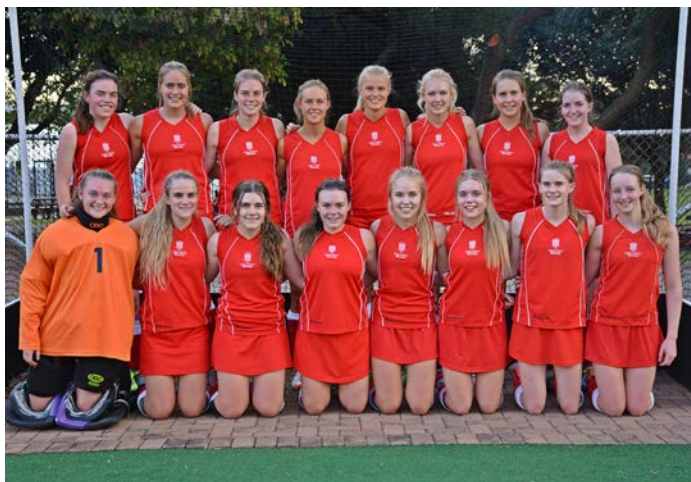
1 st hockey team