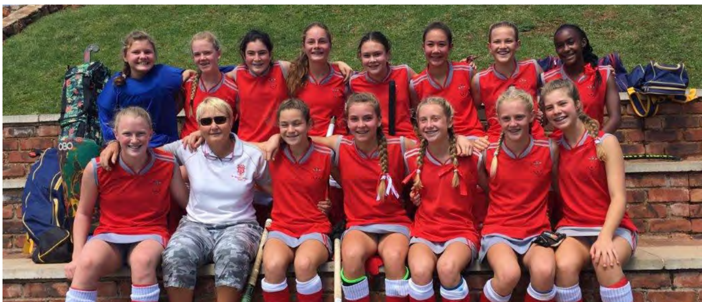
U14 A hockey team