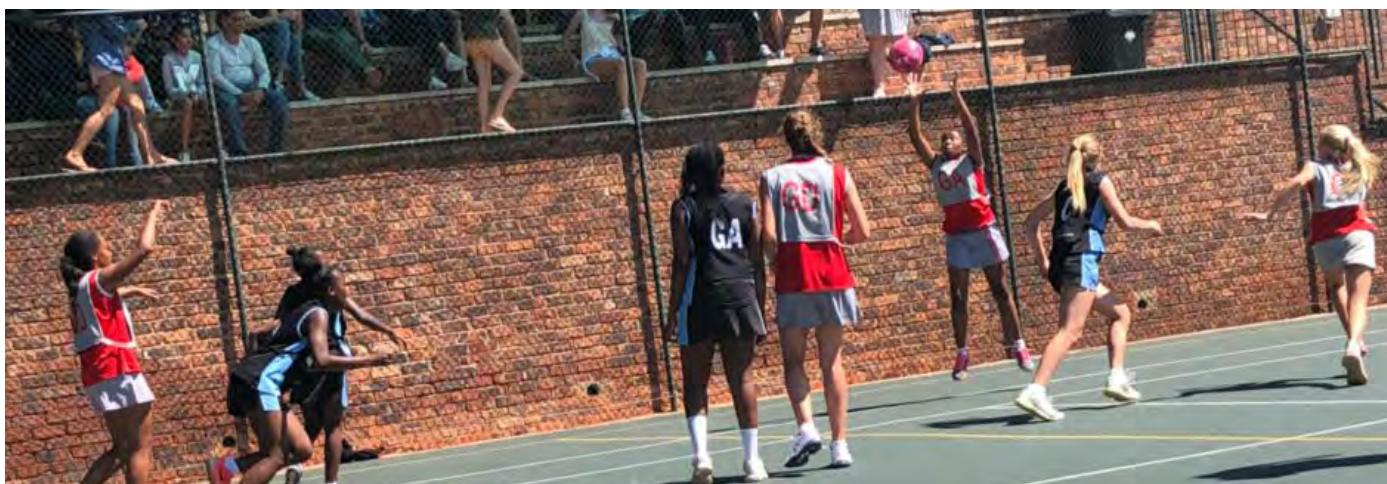
Attacking for the ball