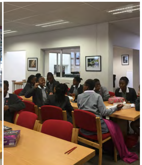
The excitement building up during the Lyric to the Book Quiz