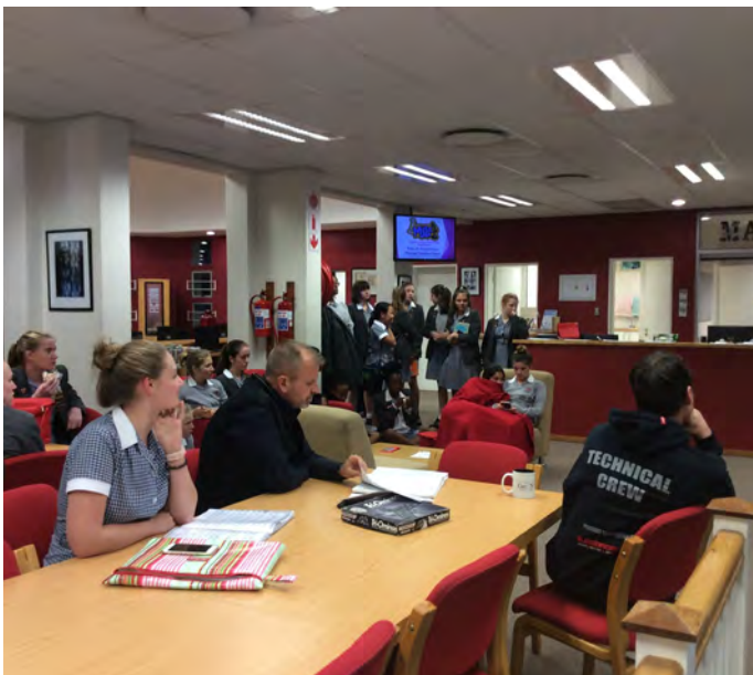
Collaboration with the Music department