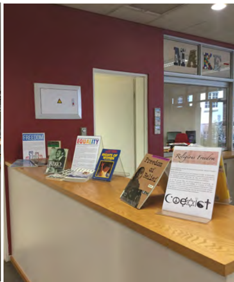
Human rights display