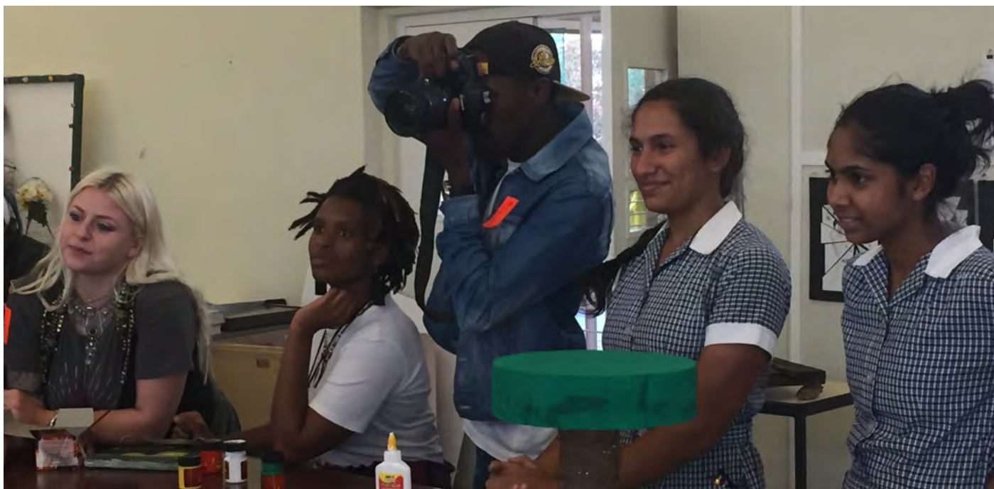
At the creative workshop