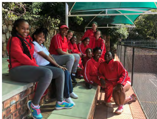
Waiting for the games to begin