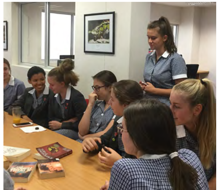
Teen book club official launch

St Mary's Senior School library celebrated South African Library Week from 16 to 23 March.