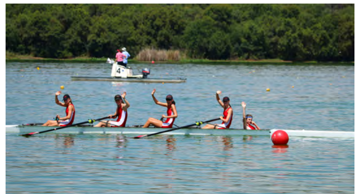
U16 winning quad

Half-term arrived and with it, the SA Schools' Rowing Championships. The St Mary's rowing club was ready to race and dominate. The culmination of our hard work during technical training sessions, strength training and fitness was rewarded with great success. The St Mary's rowing club placed second behind St Andrews Girls' School losing by only a few points. We achieved a staggering nine gold medals, five silver medals and three bronze medals.