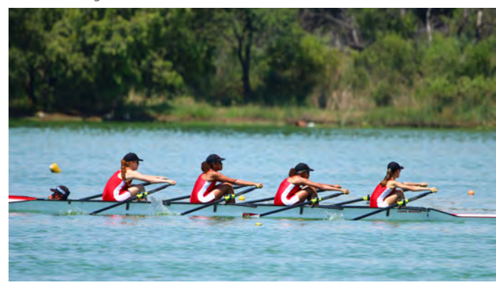
U15 quad racing