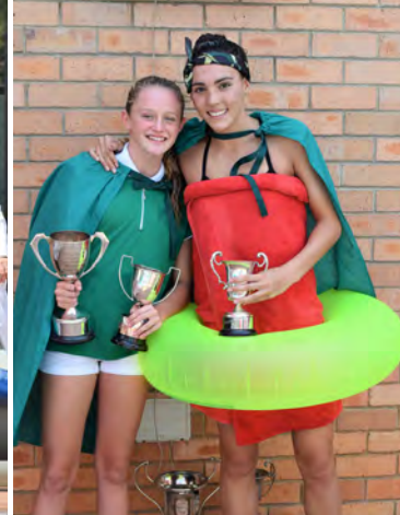
Sport Snails with their medals