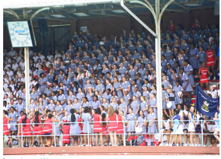
Supporting our girls!

The Premier inter-high gala was held in near perfect conditions on Saturday. Our girls swam superbly. There were a great number of season's best times and, once again, the support from all team swimmers, spectators and the spirit squad was awesome. We were well beaten by St Stithians but we refused to let that put a dampener on our outstanding showing.