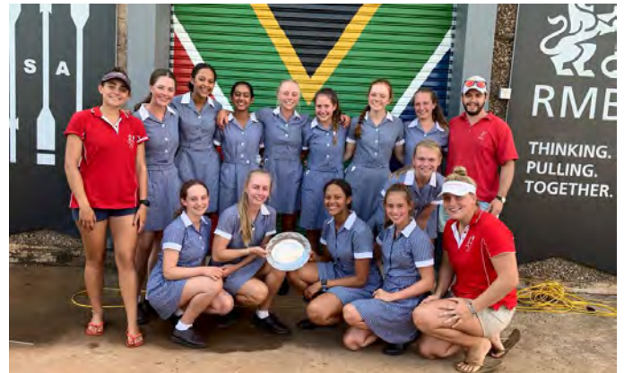
U16 age group