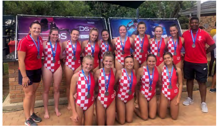
Silver medalists of the Reef Cup Water Polo Tournament