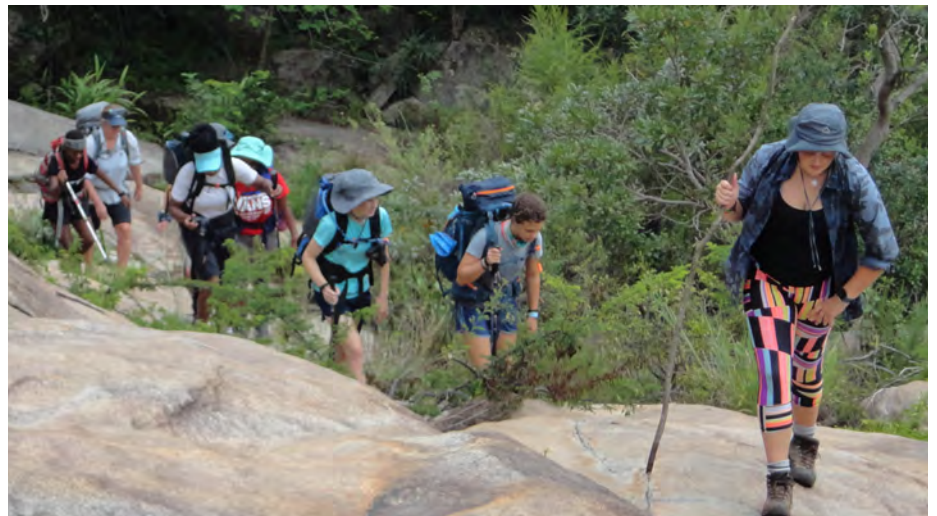
Climbing a rock face in Barberton