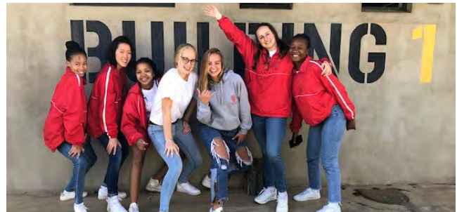
Form V Geography girls