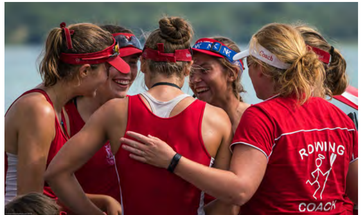
1 st quad after the win of a lifetime