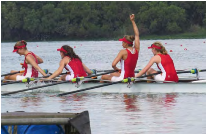
First quad upon hearing they won by 1 100 th of a second