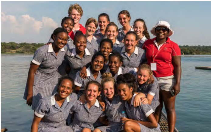
U15 age group