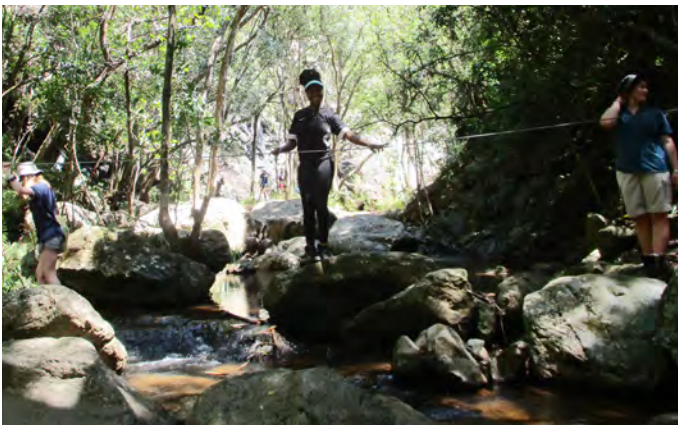
There were many river crossings