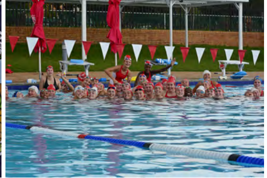
Swimming teams during the final week