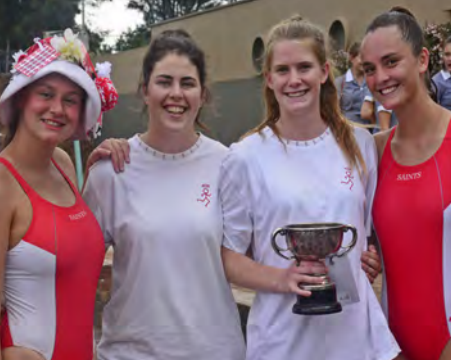
Proud matric girls with the A gala trophy