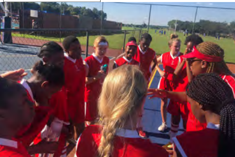
1 st team