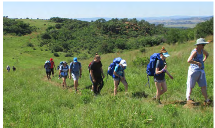
Hiking in the Klipriviersberg Nature Reserve

Twenty girls and four staff members will be travelling to Costa Rica in the April holidays with World Challenge to undertake community service, a five-day trek, white-water rafting and relaxation in the Caribbean. In order to check fitness levels and assist the girls with checking their gear, we undertook two practice hikes. The first one was in Barberton over three days; the second one was a half-day 15km walk in the Klipriviersberg Nature Reserve in Kibler Park, south of Johannesburg. These were invaluable for the girls to test out their