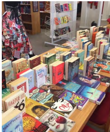
Tables of tempting titles