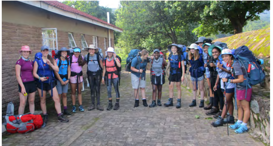
Getting ready to leave on day one