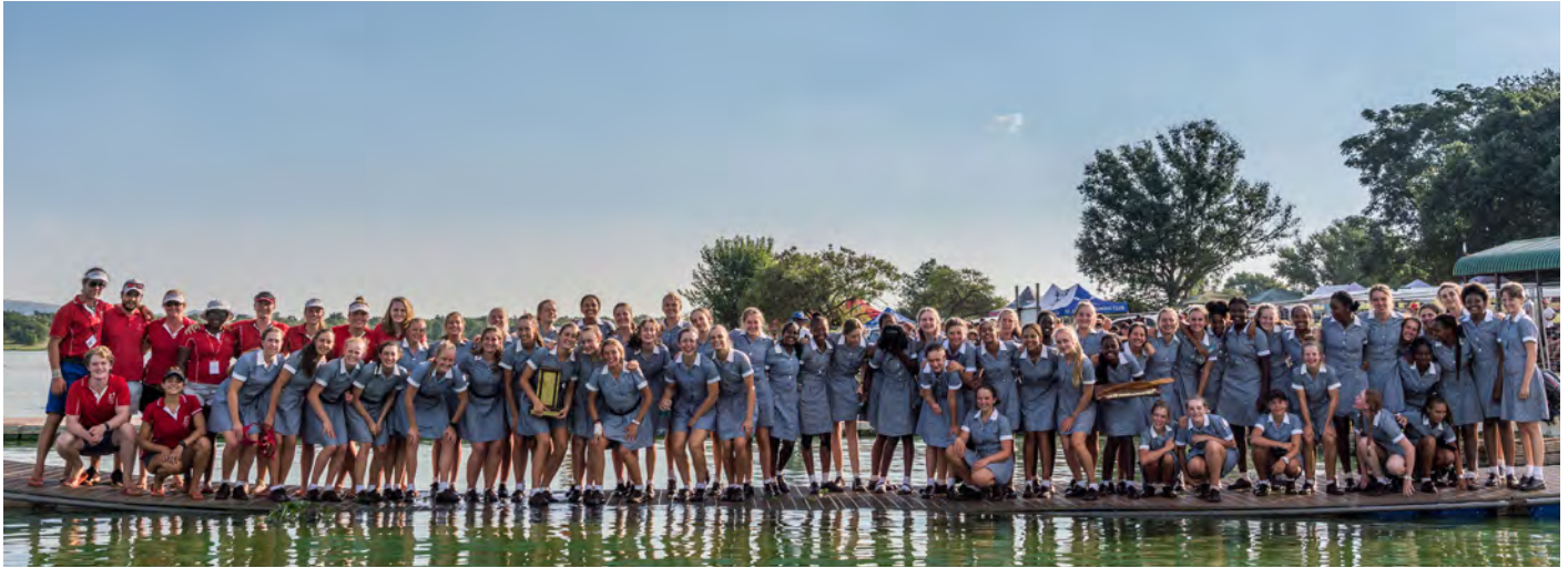
Winners of the 2019 South African Schools' Rowing Championships girls' section