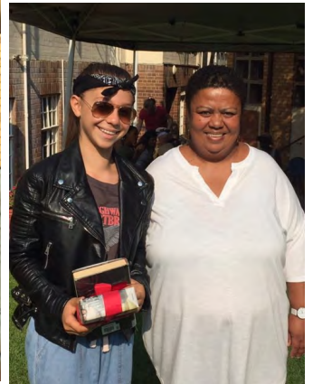
Form I Y Tyla