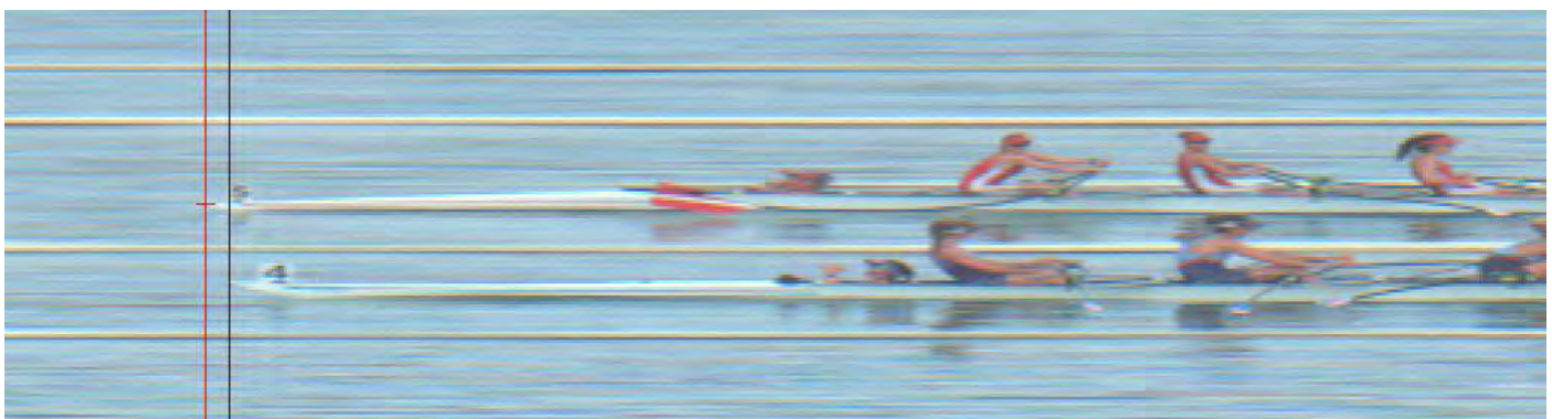
Photo finish: first quads race right down to the wire against St Andrew's!