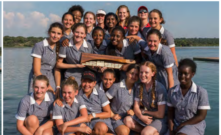
U14 age group