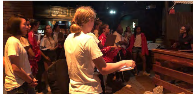
SAB World of Beer