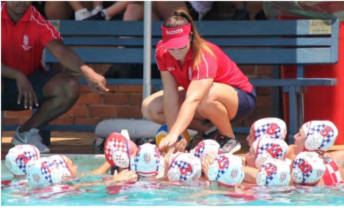
Team talk at the 2019 finals of the Reef Cup Water Polo Tournament