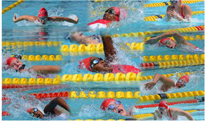
B team at Inter-high A gala