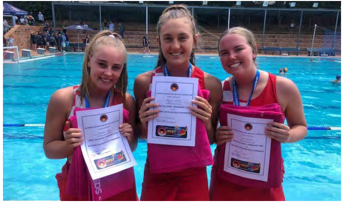
The players who were selected for the Reef Cup All-Star Team