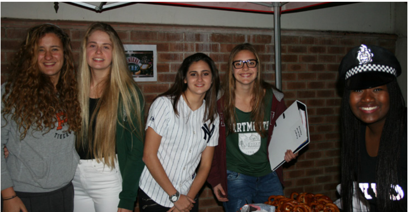
Form III girls sell doughnuts and pretzels