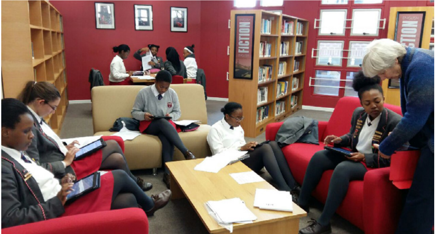
Matric final isiZulu CAT on iPads