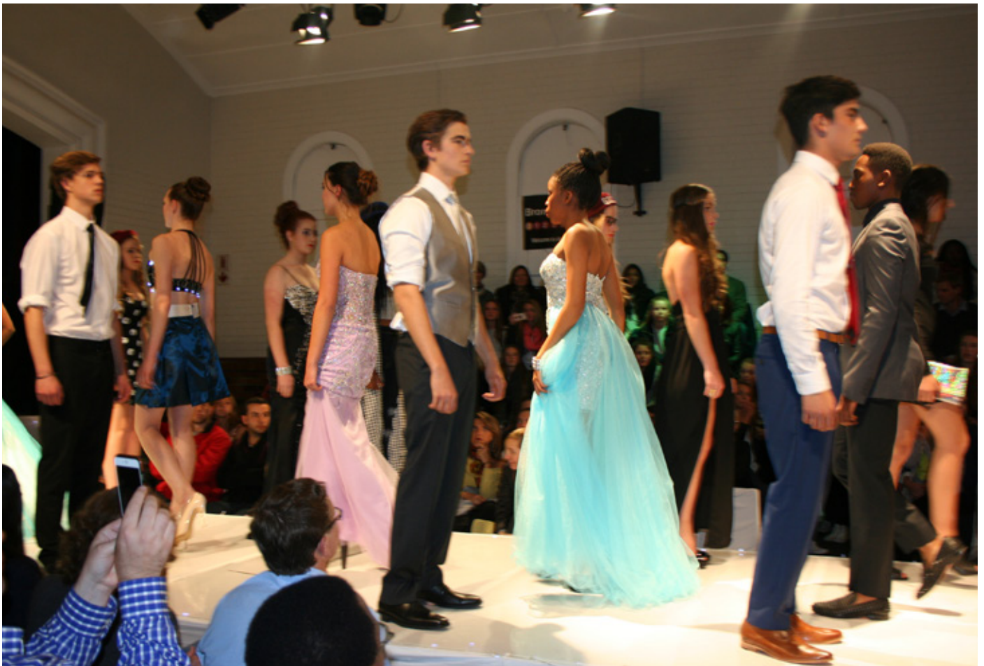
Models show off their favourite outfits