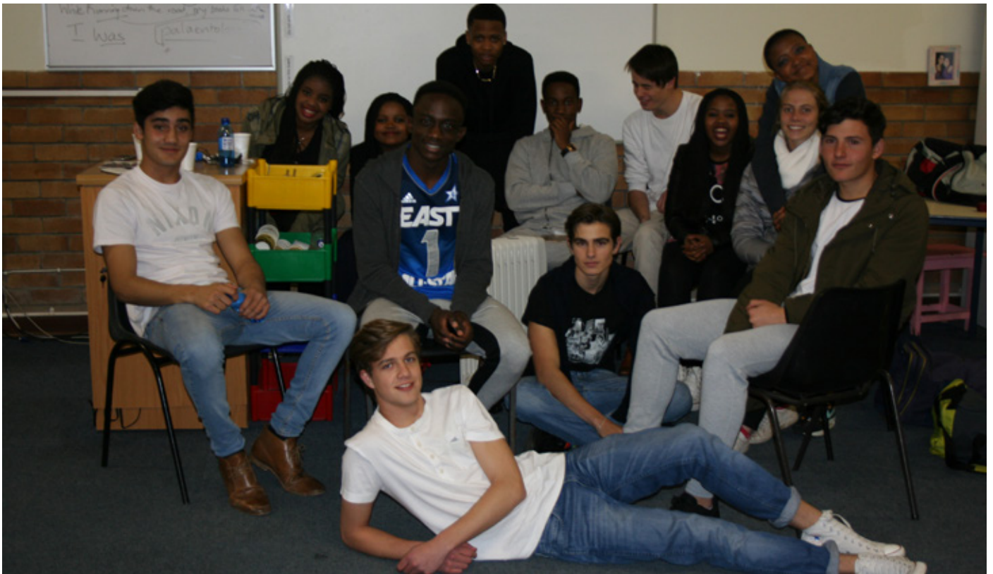
The calm before the show