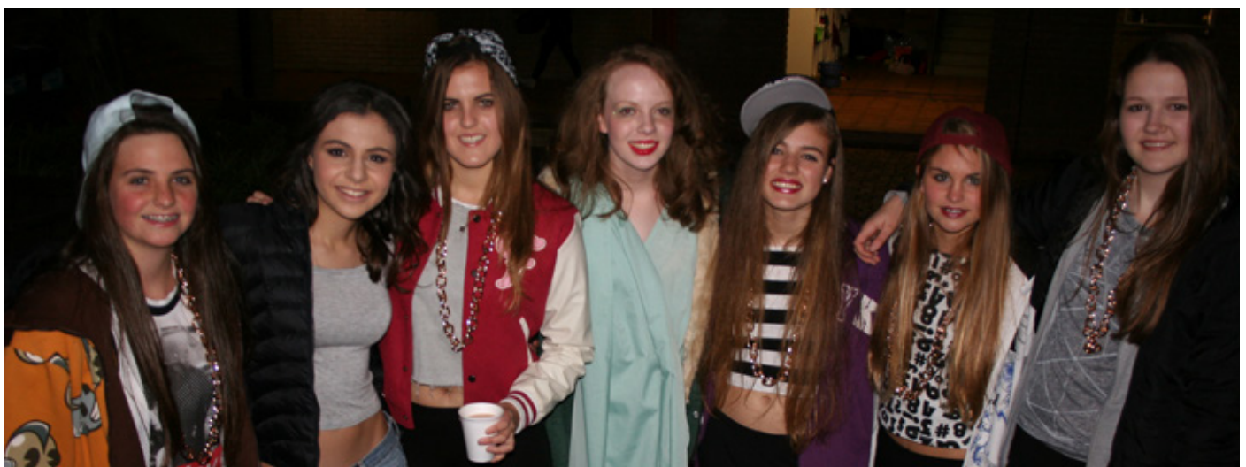
Form III girls get into character beforehand