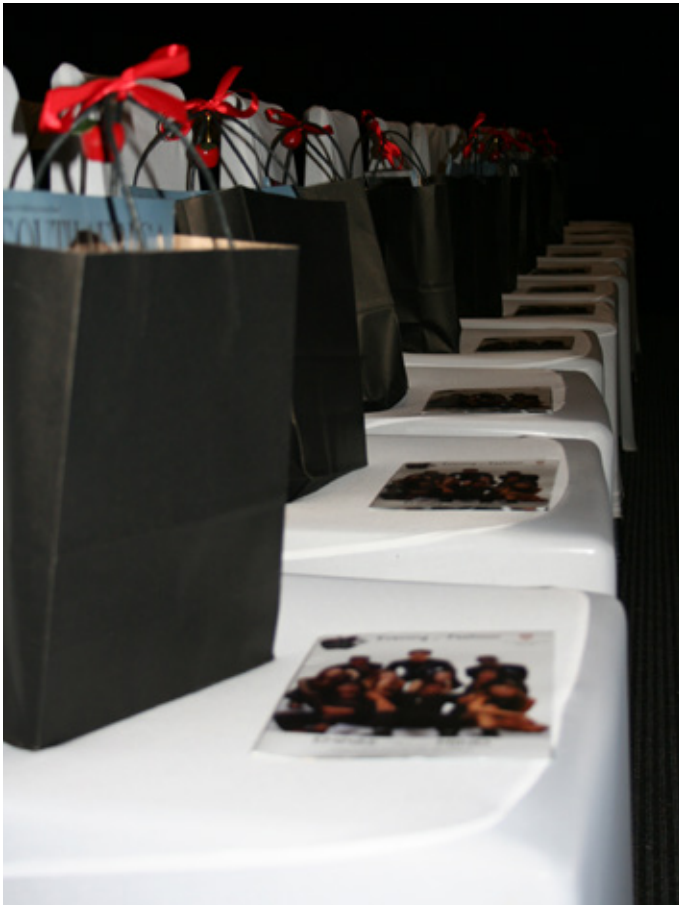
VIP seating with goodie bags