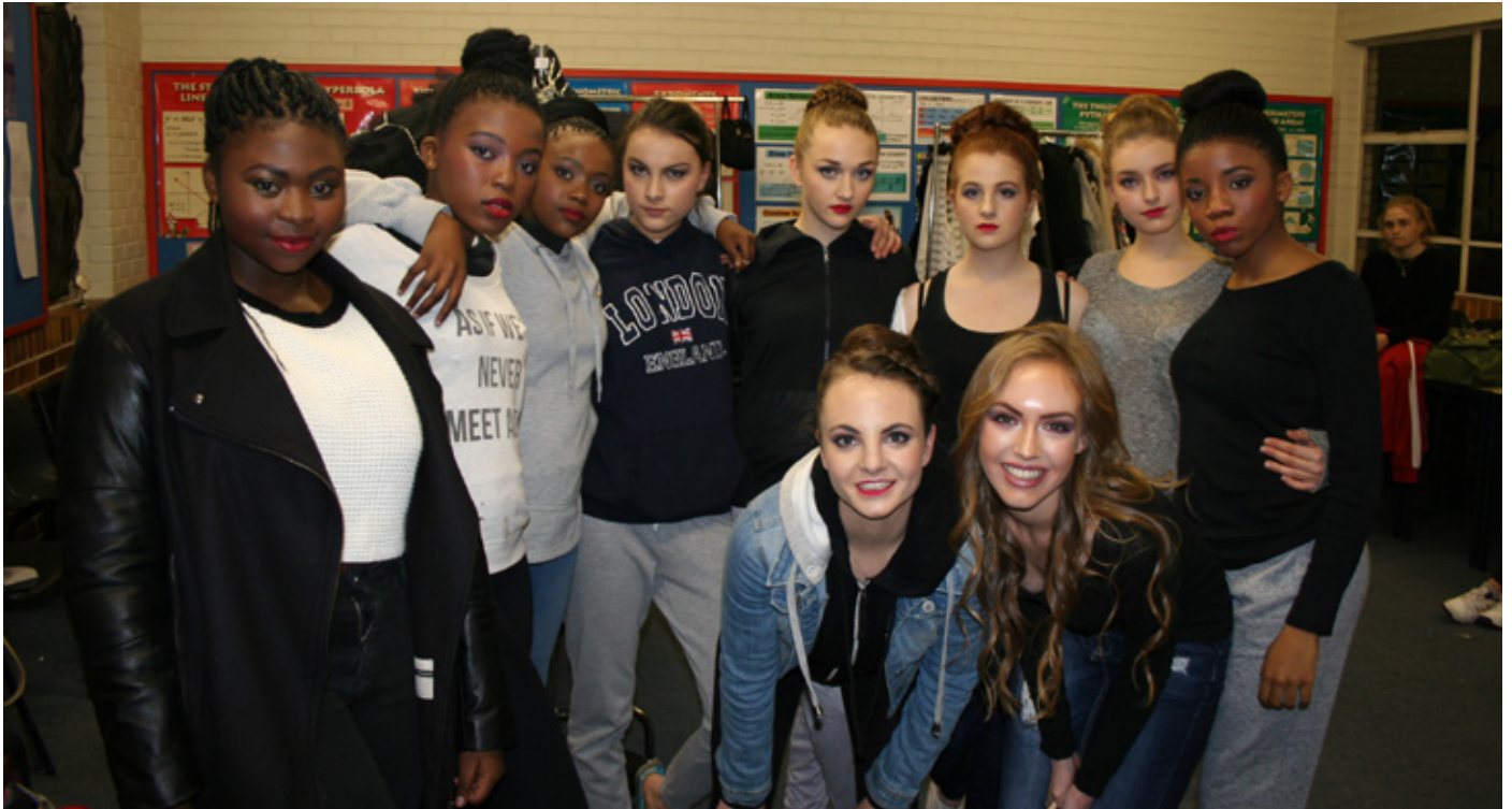
Thank you to the moms who did the models' make-up so beautifully