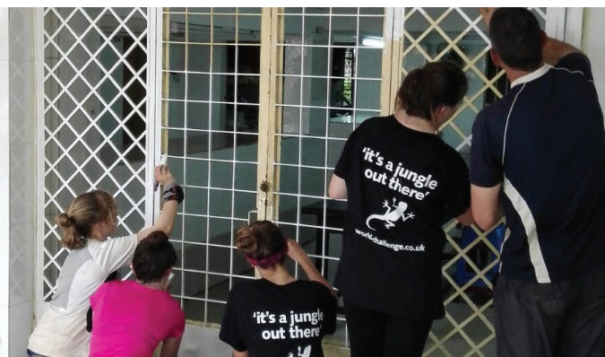
Doing community service at the orphanage