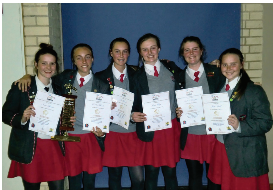
Some of the St Mary's riders at the Jo'burg Metro Awards evening - as some of the girls attended the hockey dinner, they were not present to receive their awards