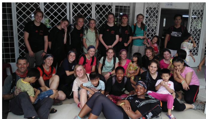
Girls with some children at the Dieugiac orphanage