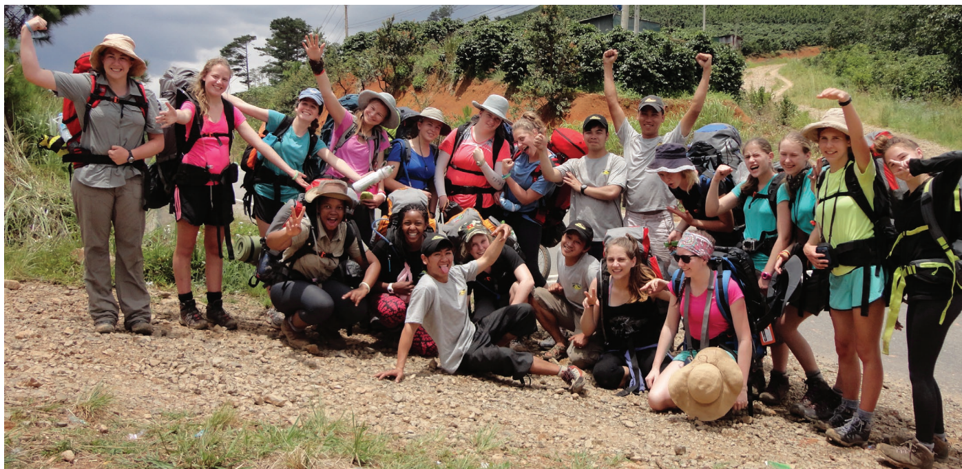
In the Dalat region, completing the four-day walk