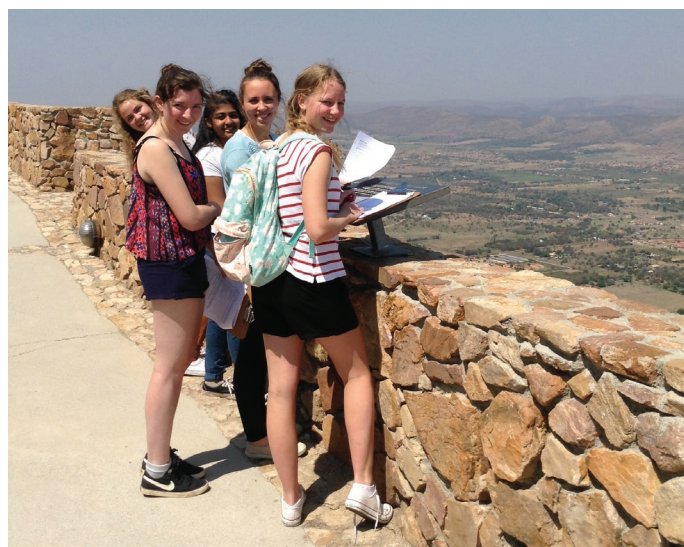
Completing the worksheet from the top of cableway

The Form III Geography girls visited the site of the Harties Metsi A Me programme, where they learned about the sustainable use of water and the distinct possibility of watershedding in our country. They were encouraged to make a “donation” to the yellow water recycling project, introduced to Australian red wriggles at the vermiculture site and shown how tyres are used to prevent mass wasting on slopes. The girls had an opportunity to see the sluice gates of the dam and walk across the dam wall.