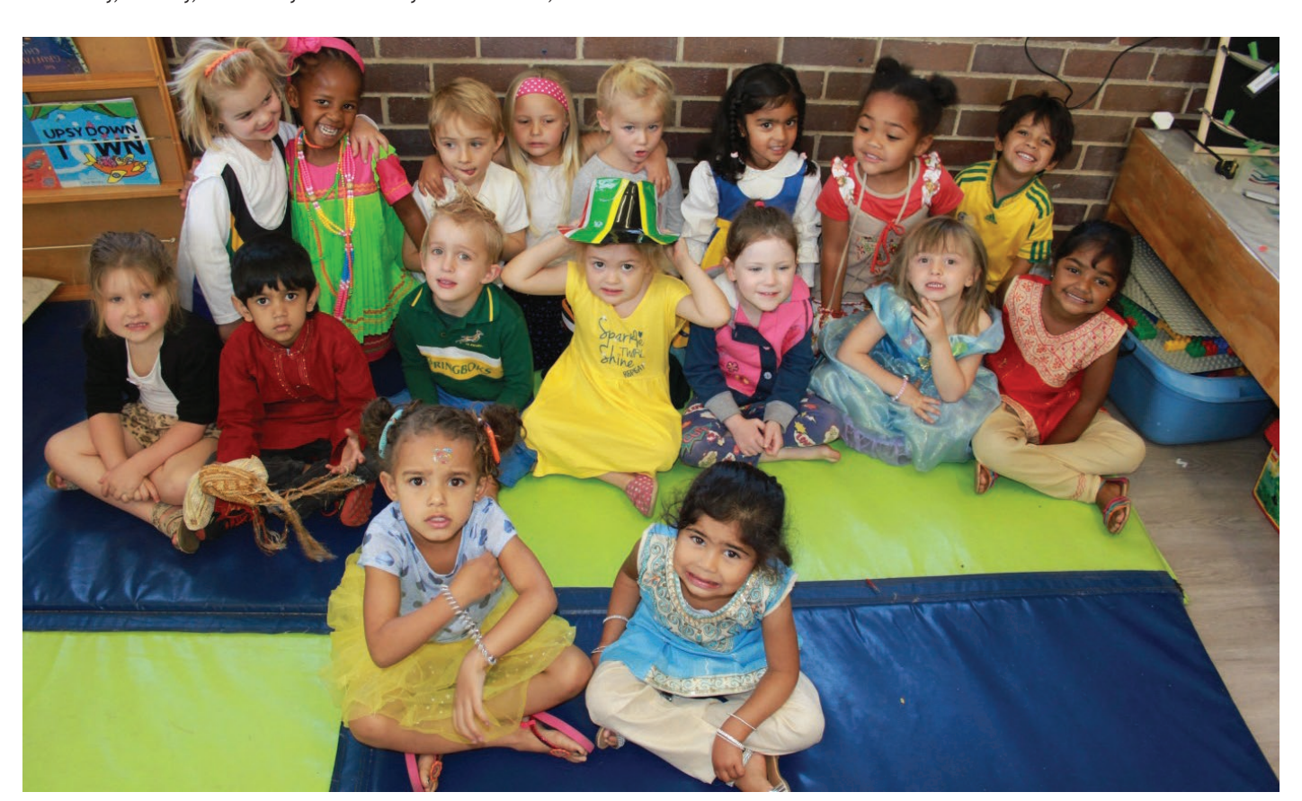
Grade 000 T celebrating Heritage Day