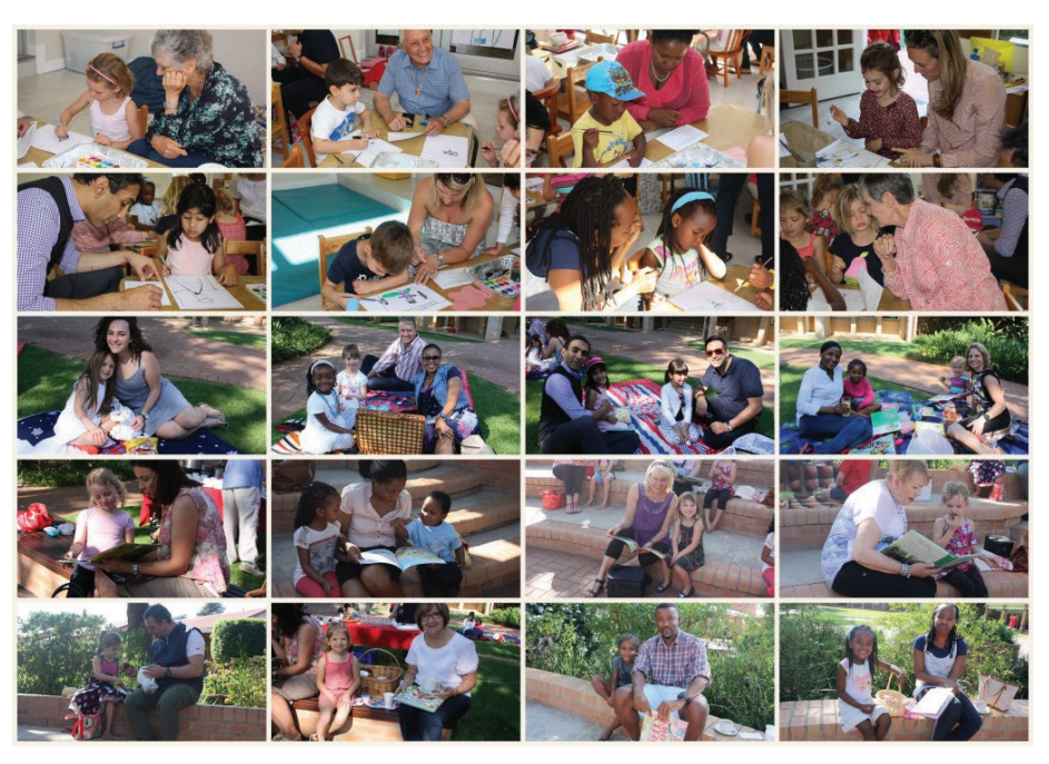
Grade 00K Special persons visit