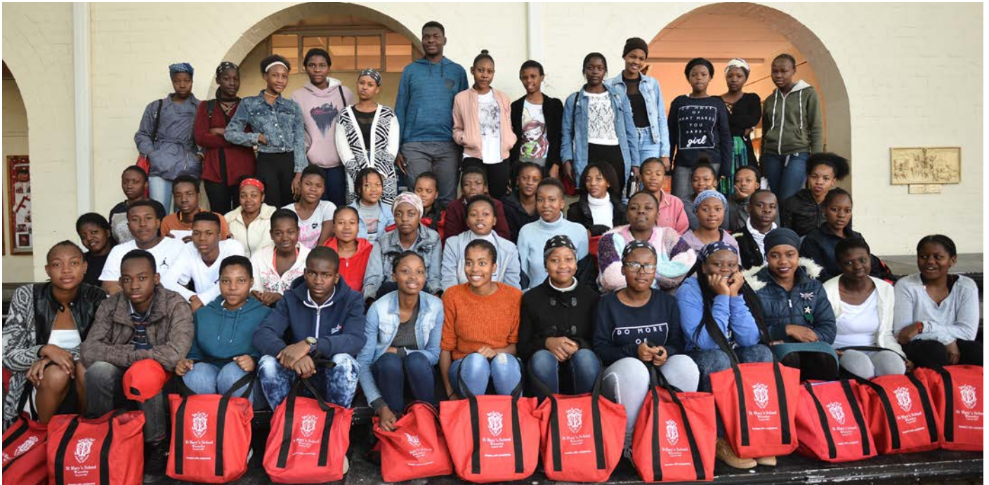
The school is embarking on a month-long clothing drive in support of the Ikusasa Lethu programme (please see some of the pupils above). Details of the campaign are on page 3