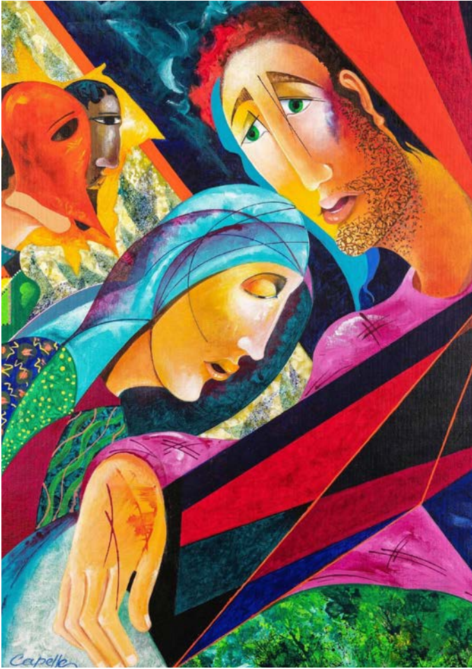
The Fourth Station: Jesus meets his mother

Mary, a grieving mother, bows towards her Son in an effort to comfort Him. Anguish is expressed on Jesus' face as He looks down at His suffering mother. His mental suffering is greater than His physical pain at this moment. The two figures in the background represent the executioner, in a red hood, and a member of the hostile crowd.