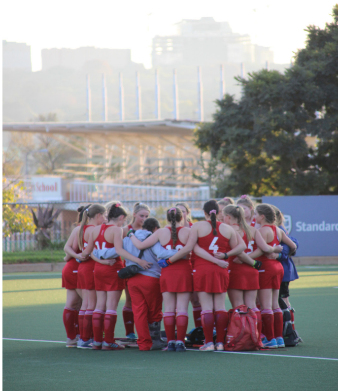
The 1 st team before the start of the game

Each year, within the Grays Hockey League, the St Mary's U14 to 1 st hockey teams and the St Stithians Girls' College U14 to 1 st hockey teams meet for an afternoon of friendly rivalry and great hockey. This year was no exception when the teams met at St Mary's and St Stithians