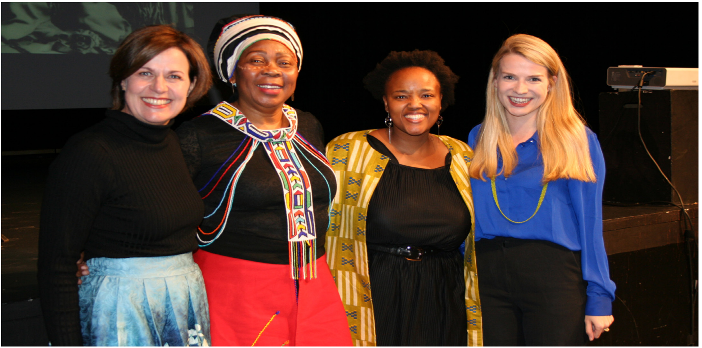
The first annual Maxeke-Mgqwetho lecture took place on Thursday 23 May. It was an interesting and informative event and one that we hope will continue for years to come