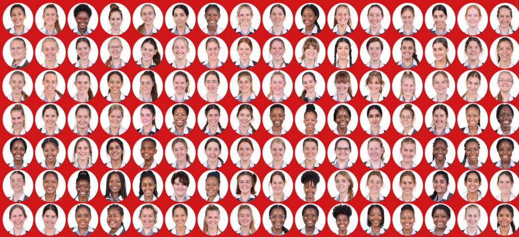
Celebrating the class of 2021