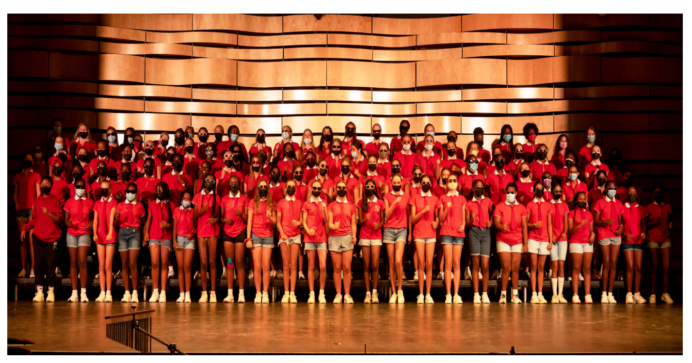
Clean sweep: Furse house, the winners of the inter-house gala, spirit cup and inter-house music on Thursday 24 February

Tel: 011 531 1800 | info@stmary.co.za | www.stmarysschool.co.za