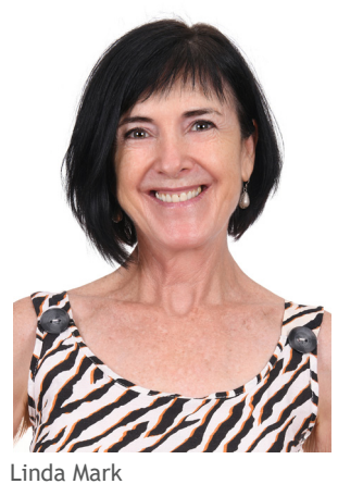
BA, MA (Wits), HDE (UNISA)