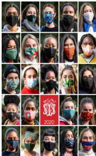
2020 Annual Magazine