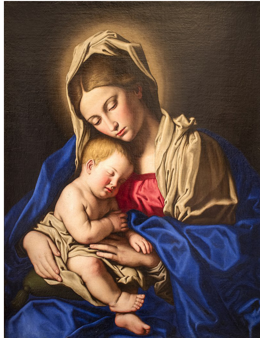
Madonna and Child

And when lips are moved by Grace They so sweetly sing Pray for peace in Africa From the loving God