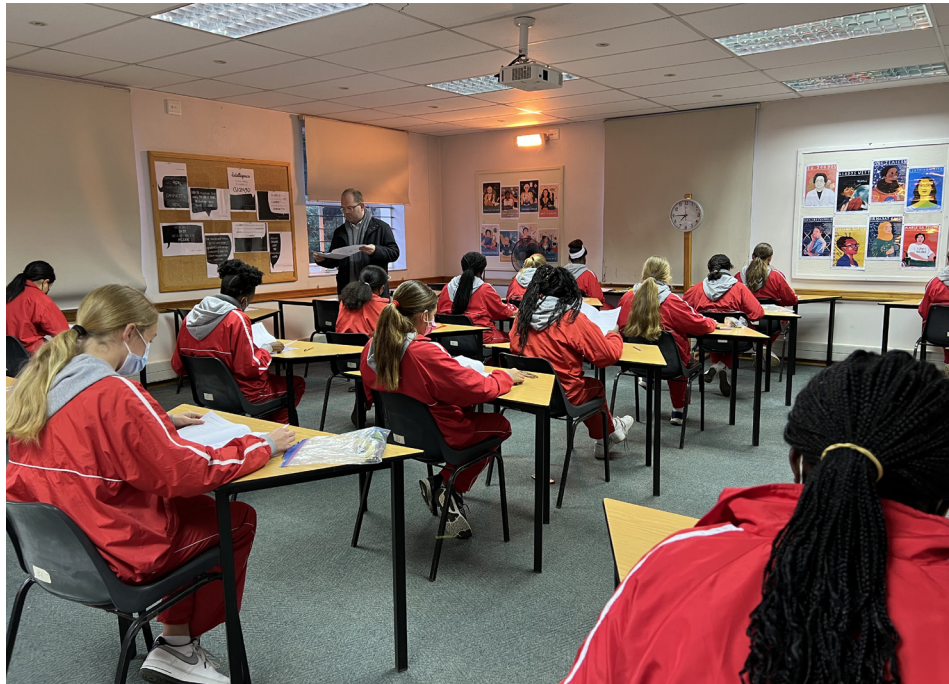
The girls writing their mid-year examinations

Tel: 011 531 1800 | info@stmary.co.za | www.stmaryschool.co.za