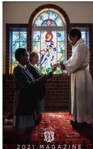
2021 Annual Magazine