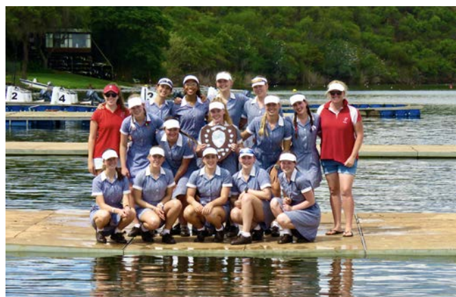
Rock solid open age group (see results below):