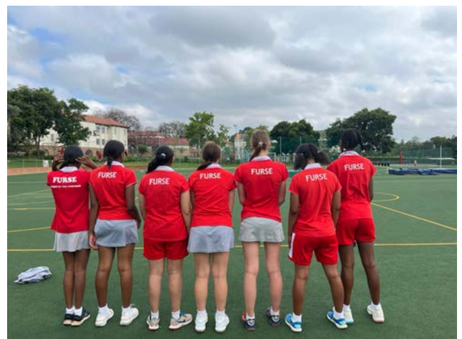
Furse inter-house basketball team