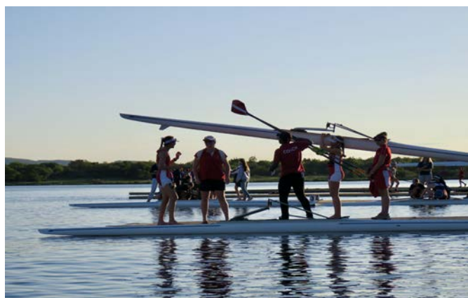
Early morning preparation