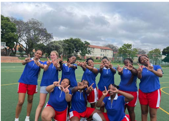
Winners of inter-house basketball - Phelps House