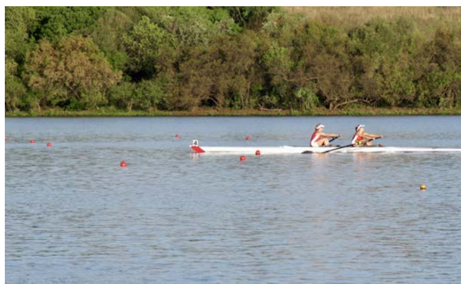
Winners of the 1 st pair