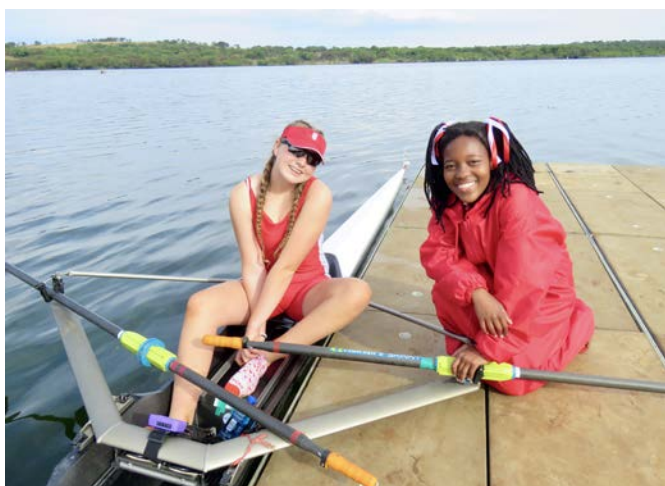
Silver medalist of U16 sculls