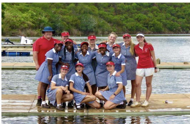
Slick and strong U16 age group (see results below):