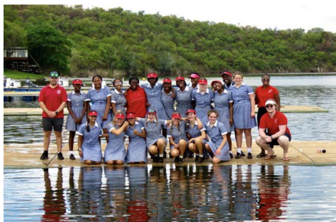
Mega U15 age group (see results below):