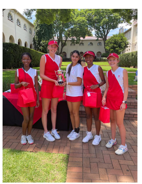
First team with cup