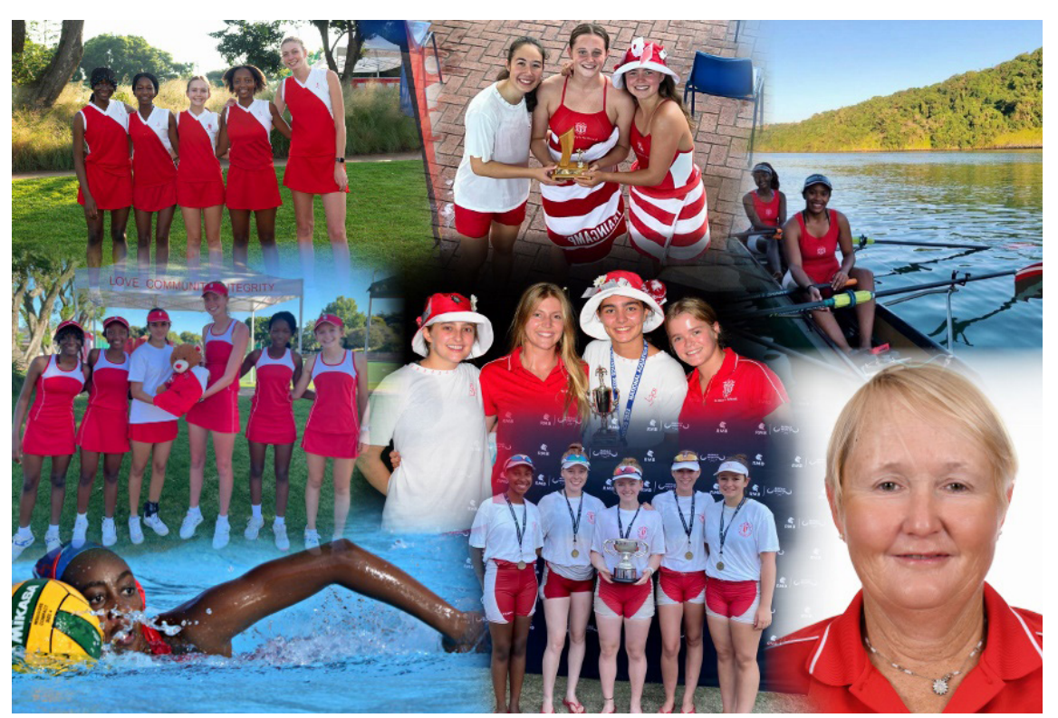
A great weekend of sport (11-13 February)

Tel: 011 531 1800 | info@stmary.co.za | www.stmarysschool.co.za