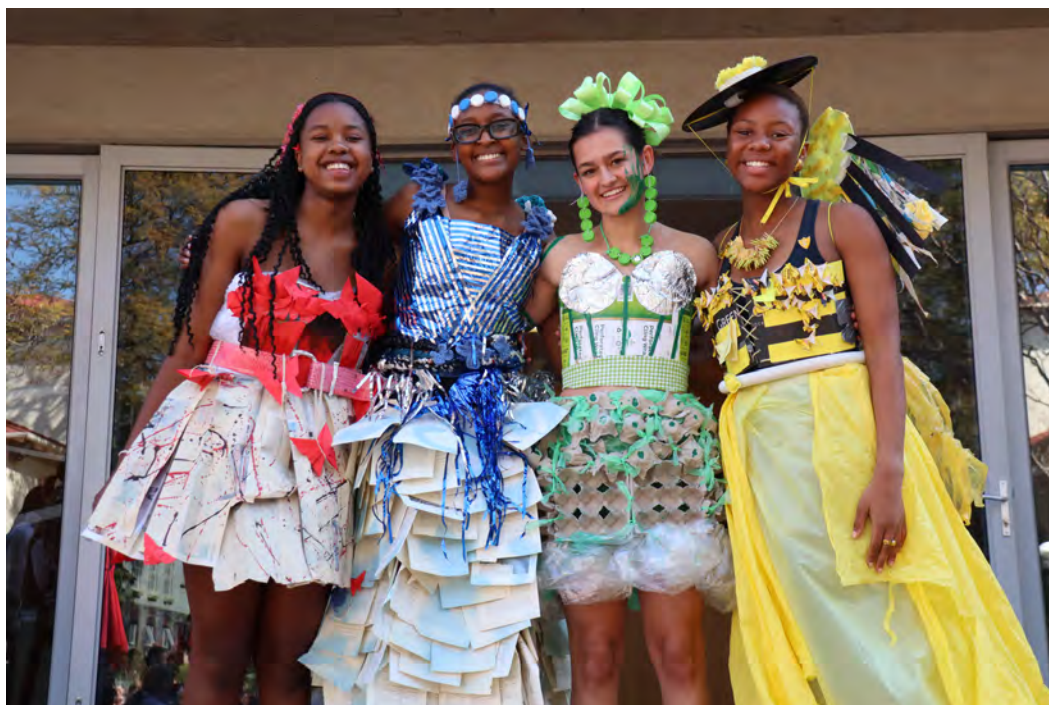
The heads of house at the Trashion Show

011 531 1831 | info@stmary.co.za | www.stmaryschool.co.za