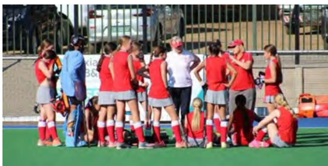
QUIX DIRECTOR OF SPORT