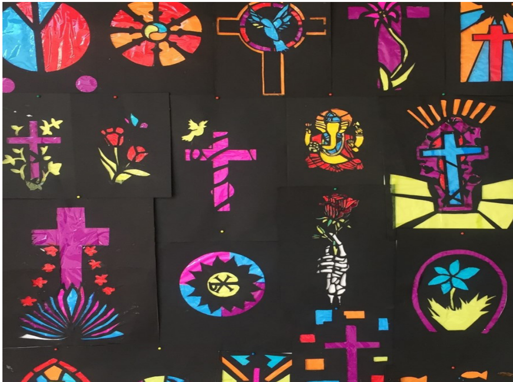
Form I stained-glass project (see page 5 for further details)