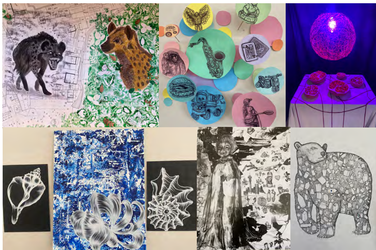
Form V Visual Art exhibition

011 531 1831 | info@stmary.co.za | www.stmarysschool.co.za