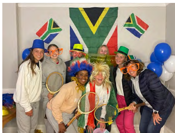
St Anne's tour, celebrating Heritage Day