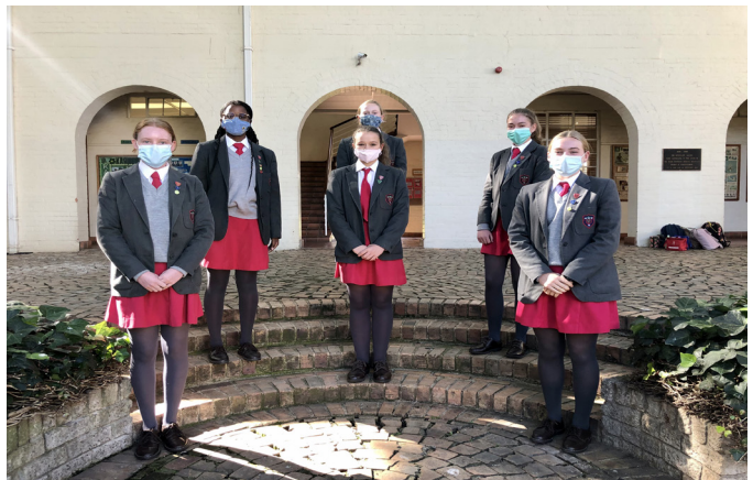
U16 girls squad