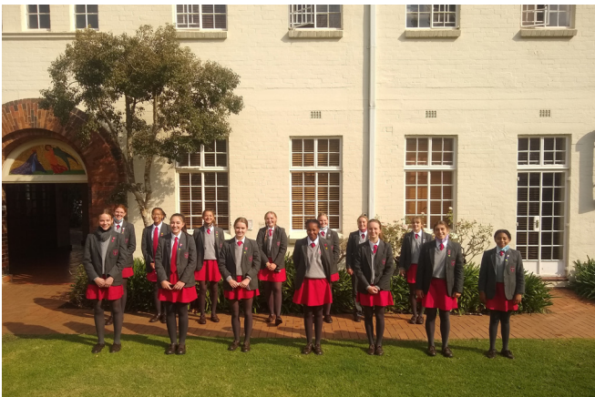
U15 girls squad