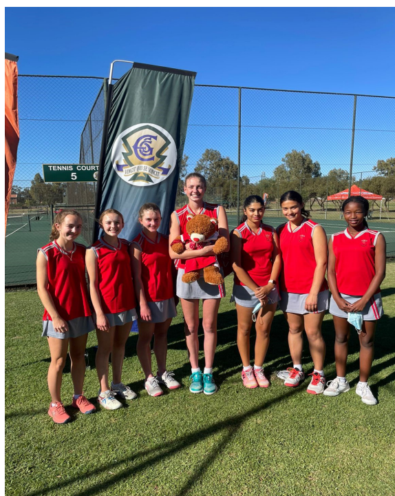
St Mary's tennis team participating in the Pat Uys Festival at Eunice