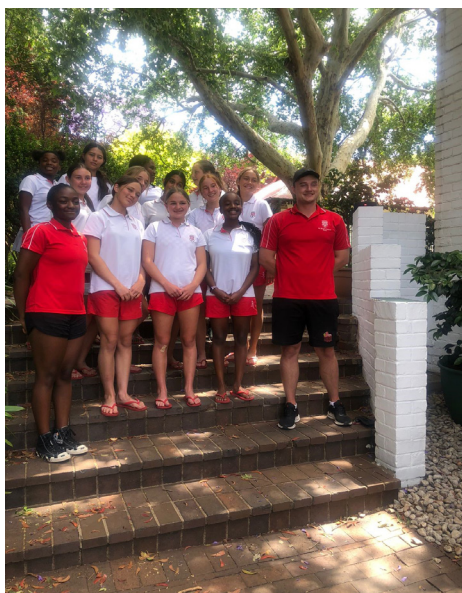
U14 team at the Roedean water polo tournament