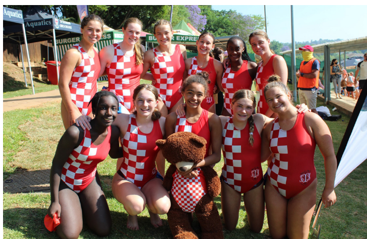
1 st team - St Stithians Invitational Tournament