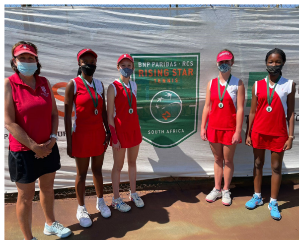
St Mary's team with bronze medals

St Mary's F losing to St Peter's B 24-28