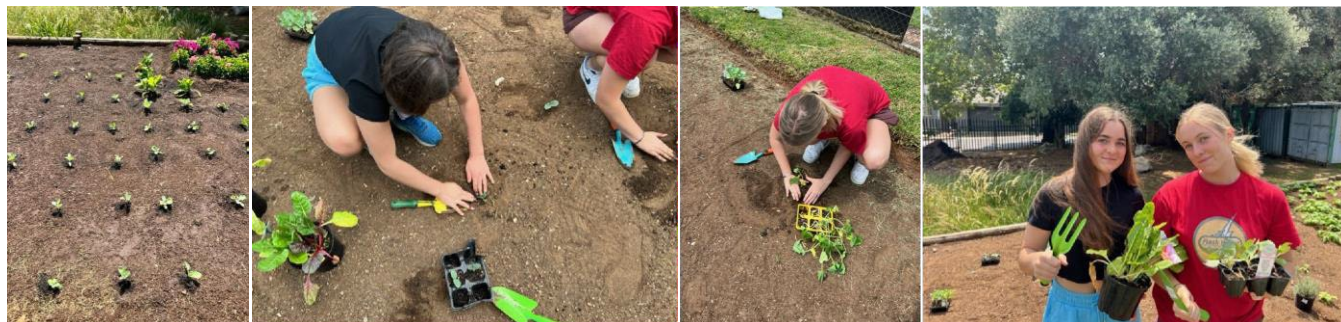
DEAN DU TOIT PHYSICAL AND NATURAL SCIENCES TEACHER

The garden, which will be tended by the girls in the club, is designed to provide fresh produce for those in need and foster a sense of community. There are further plans to expand this venture by growing in recycled crates and pots. We also plan to add fencing around the designated areas with signage to create more character. This garden is about more than just growing food, it's about building relationships and supporting each other. It is exciting to see things grow and know that we're helping the community.