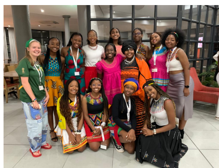
St Mary's delegates on cultural night