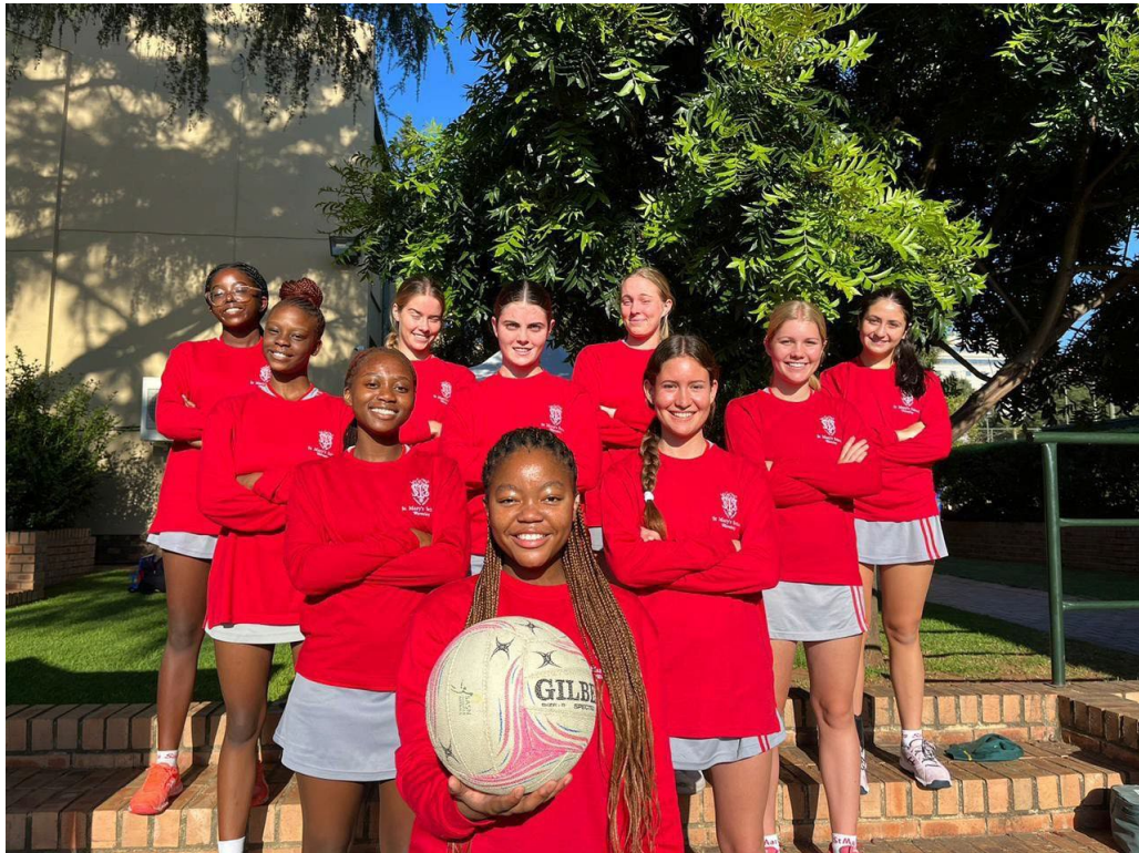
St Mary's U17 netball team (see page 8 for more details)