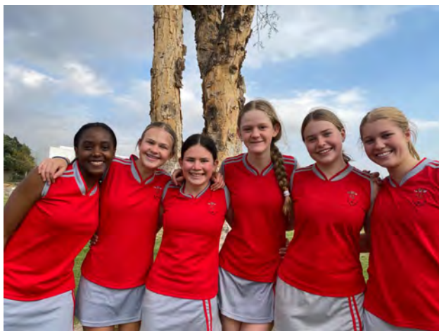
St Mary's C team