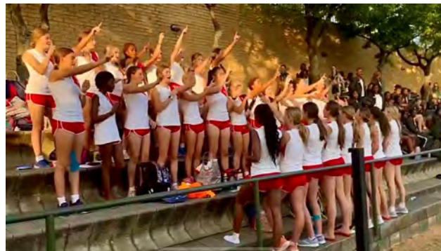
QUIX DIRECTOR OF SPORT