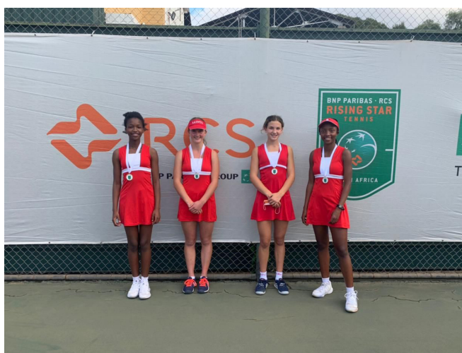
St Mary’s U16 A team that clinched first place