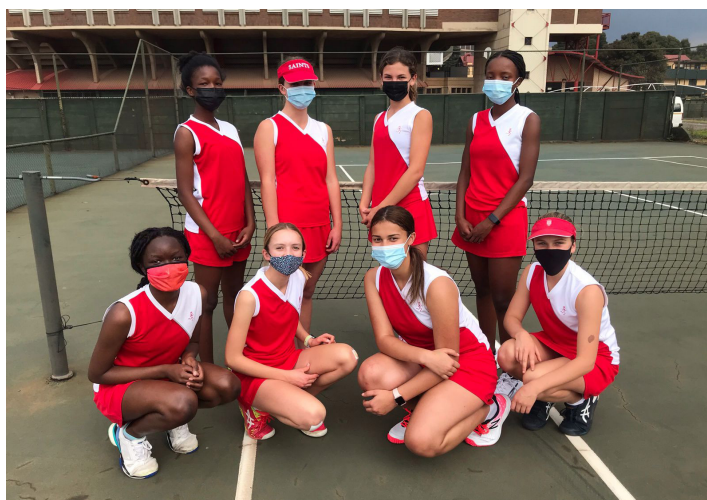
St Mary’s U16 AB teams for BNP Paribas