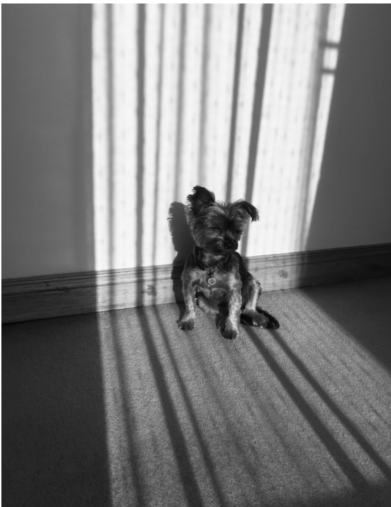
Life in Black and White: Morning Sun - Melissa Welch