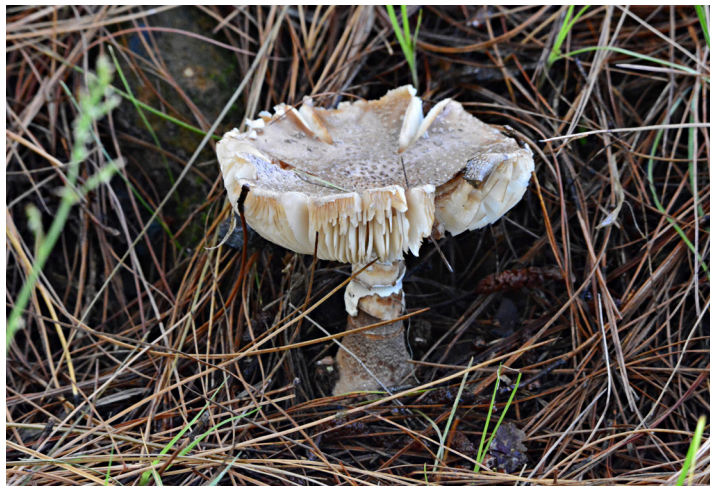
Congratulations to Quix who entered the teacher's category with Edible Fungus