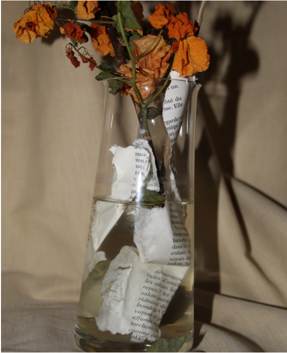
Still Life: Our Roots - Zoé Cheenne