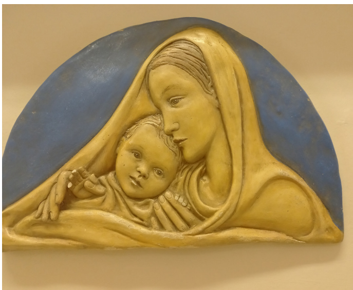
Madonna and Child

The image of the Madonna and Child is a visual reminder of our school values of love and community. The family is the first community to which children are introduced. It is also where they learn to love God, neighbour, and self. It is where they learn botho : the idea that their humanity finds fulfilment only in community with others.