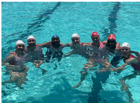
Gauteng U15 B and C

U19 Squad Nyakallo Kodisang Abigail Milella