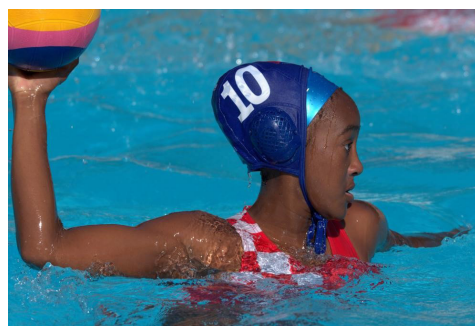
Nyakallo Kodisang U19 squad