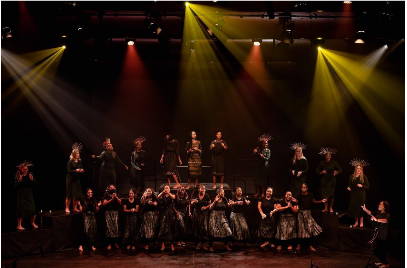
Naledi - a new musical. (see page 4, for tickets sales and more details)