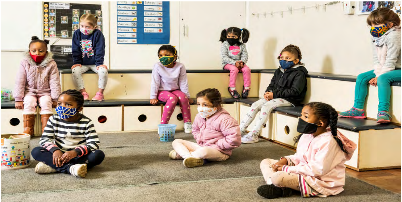
Grade 00 Little Saints girls diligently practising social distancing while listening to their teacher