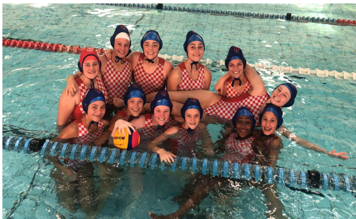
U15 Collegiate tour team