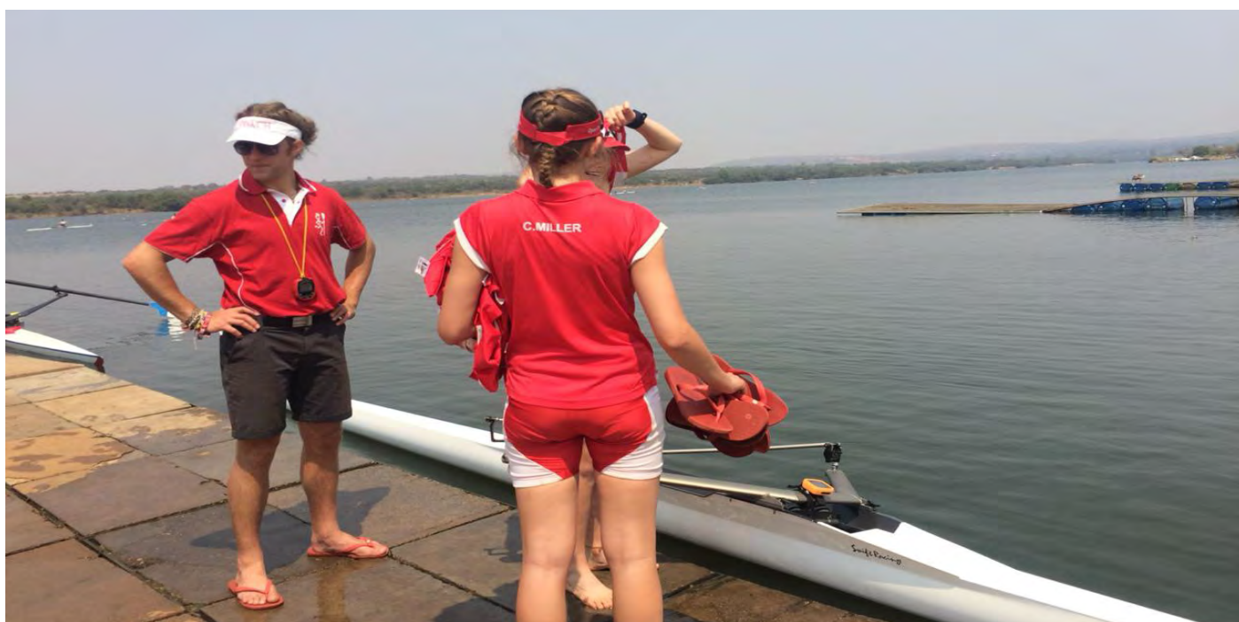
Preparing to race

St Mary's hosted the first outdoor regatta of the season. Preparations began at 06h00 on a Saturday morning: the newly returned U16 and Open girls were scattered around Roodeplaat dam – either assisting parents with carrying cartons of beverages or placing motorboats on the water. After the preparations for the regatta were complete, it was time to rest before preparing for the races: our coaches emphasise that sufficient time must be reserved purely for rest and eating.