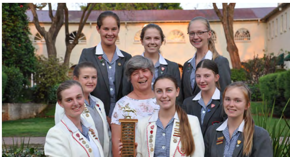
Equestrian team pre-dinner photo