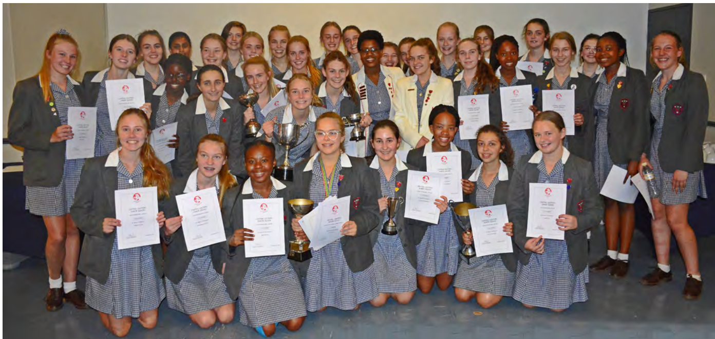
St Mary's squash team

The Gauteng Junior Squash Awards – 19 September