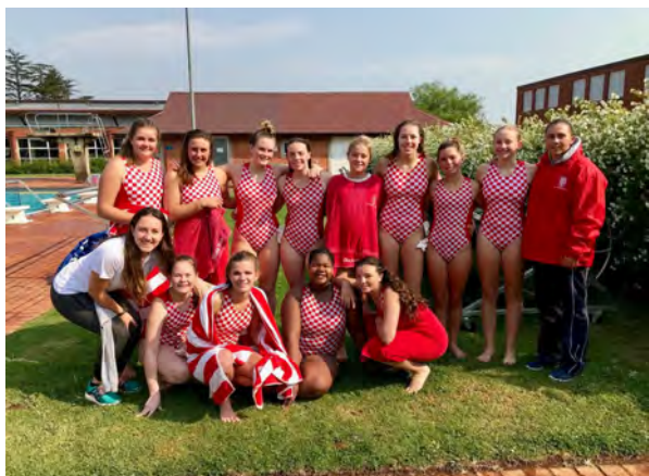
St Anne's tour team