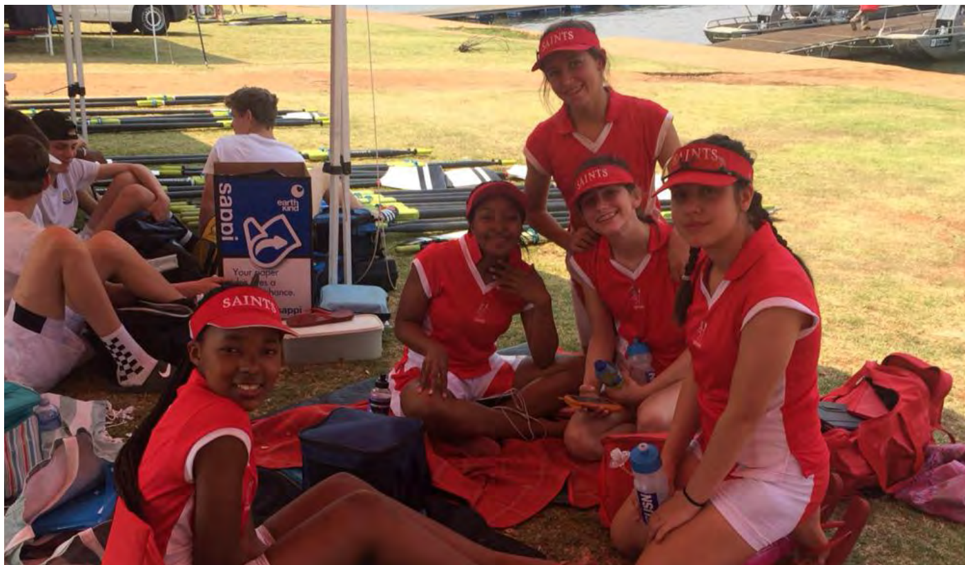
Resting before the regatta