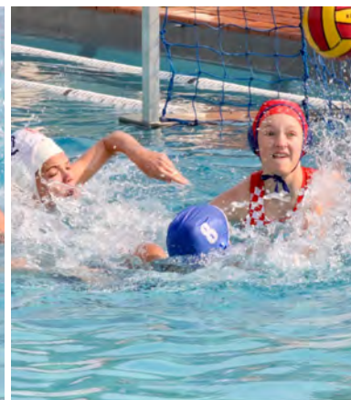
Girls in action