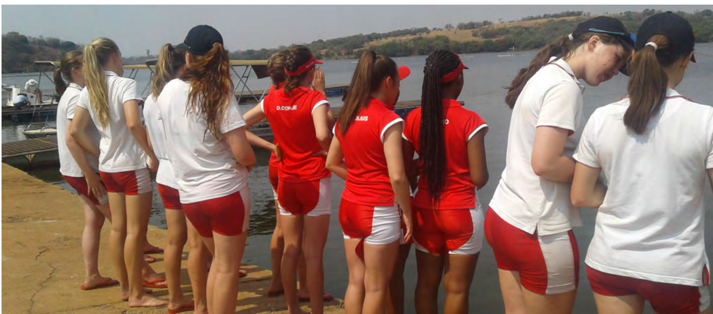
Support from the banks of the dam