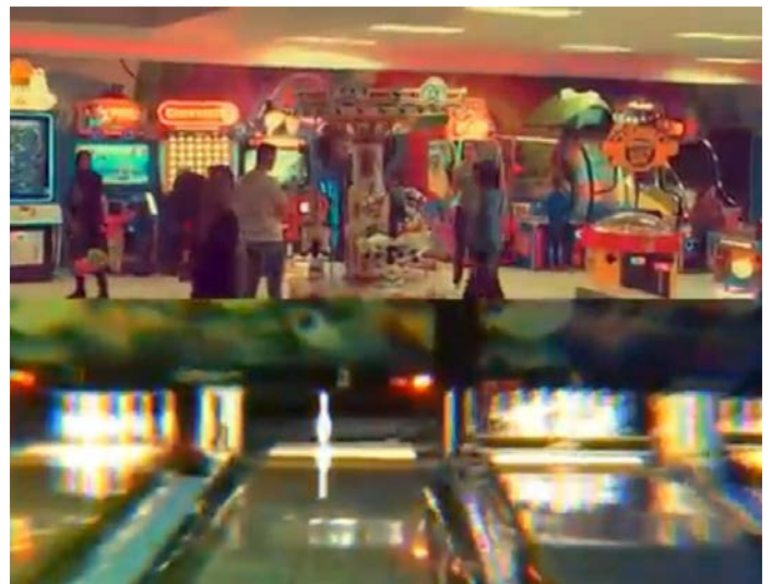
Screen shots of the winning video