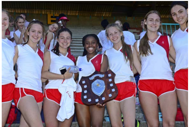
Form IV girls celebrating