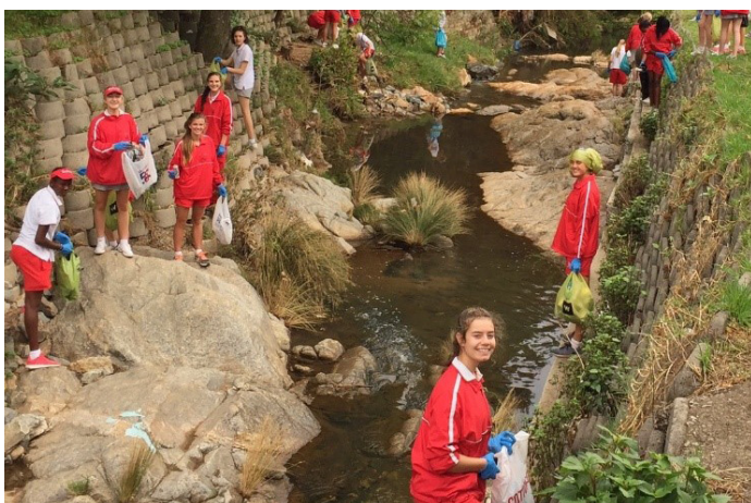
St Mary's girls do their bit for the community and the environment