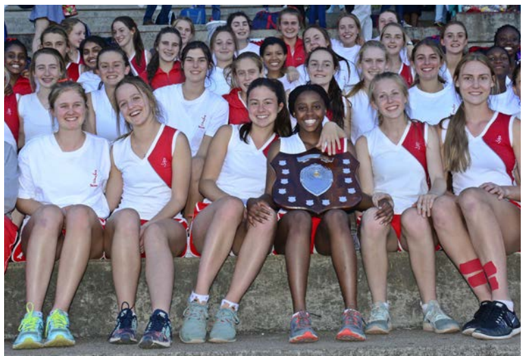
The successful team

Our annual inter-house athletics was held the morning after inter-high, before we closed for half-term. Many girls took part and it was a fun yet competitive morning with the egg-and-spoon race playing a major part in the final results. The event was won by Karney, on 309 points,