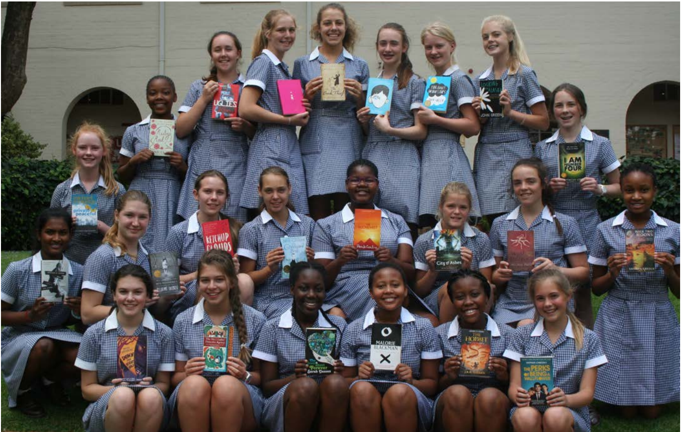
Victorious Form IM: winners of the 2017 Reading Race

Every year, the Form I girls are challenged to complete six reading tasks over the course of nine months. These include reading a magazine, a poem selected from the Senior Phase anthology, a short story, a graphic novel, a prize-winning book and a book recommended by someone else.