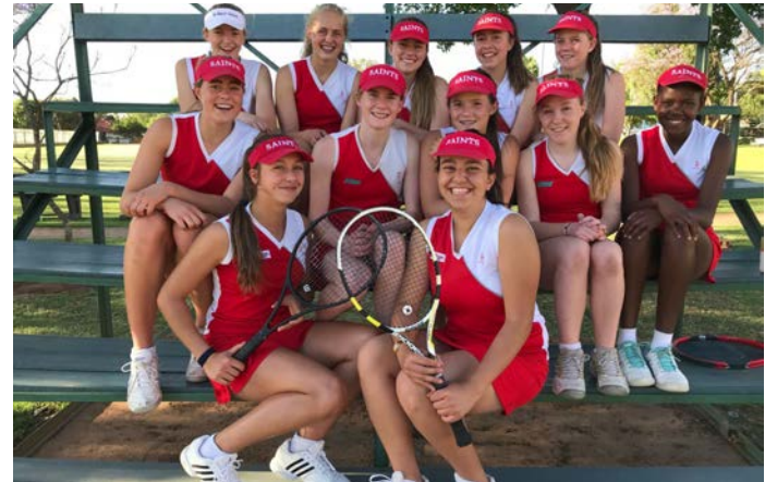
AB team that won the league: