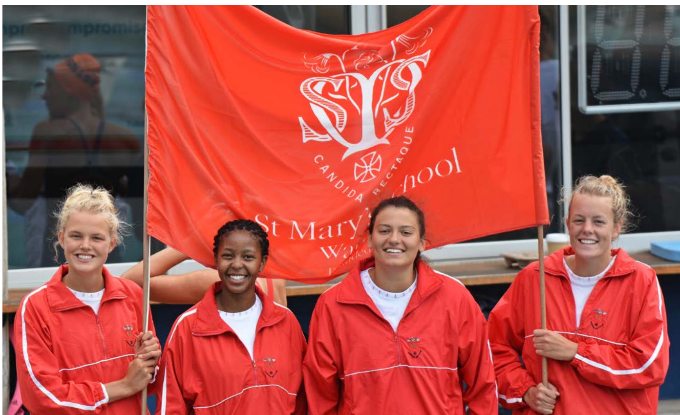
Captains of swimming, diving and water polo

They won this event by a wide margin and were in the top placings of all their events, narrowly missing gold in other races. Congratulations also to the other relay teams, which earned silver and bronze medals.