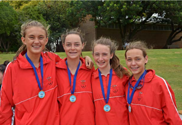
U14 breaststroke relay team with their gold medals

The final results of the gala were as follows: