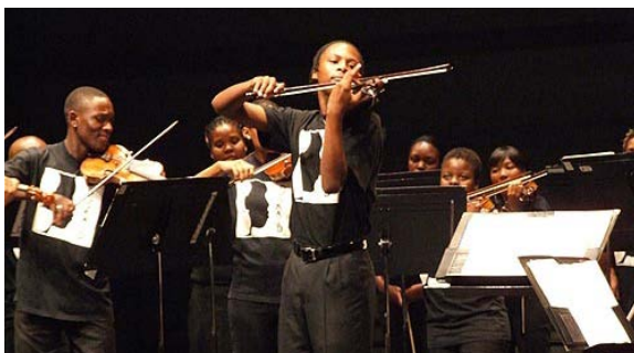
Buskaid Soweto String Ensemble