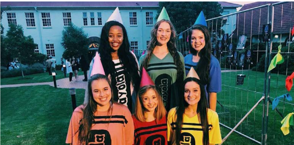
Matric girls having fun at the St Mary's social

Our children must be encouraged to take time to know themselves