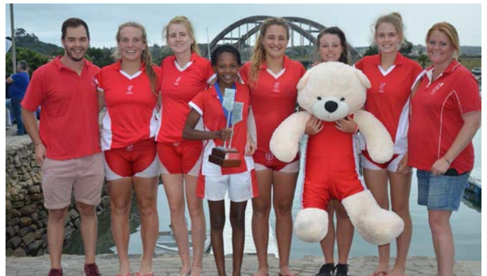
Boat Race squad with their trophy and big red!