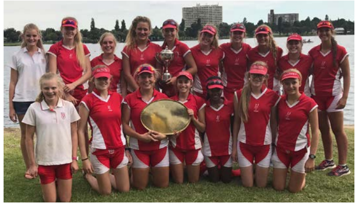
St Mary's won overall girls' school