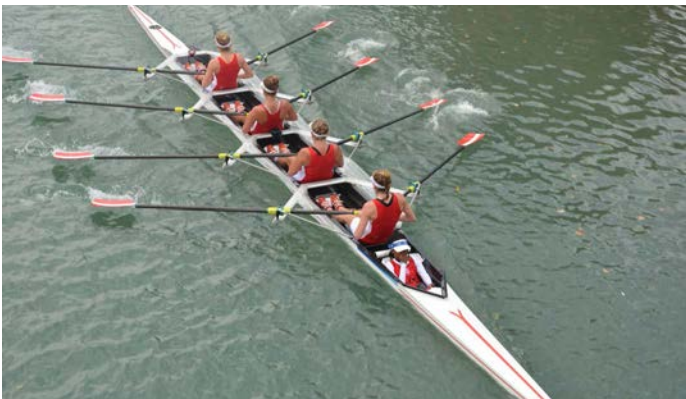
Boat Race squad powering to victory