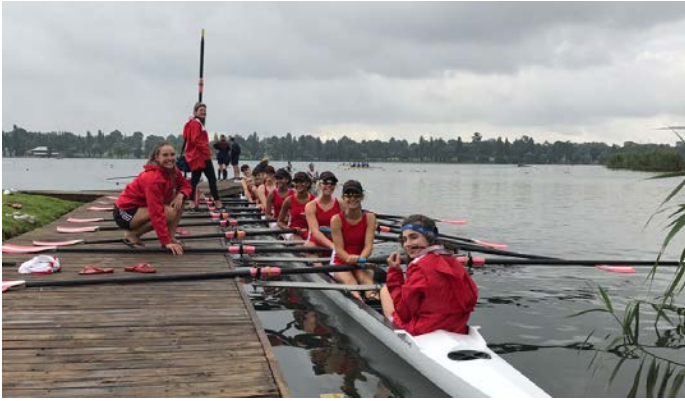
New Swift octuples' maiden voyage