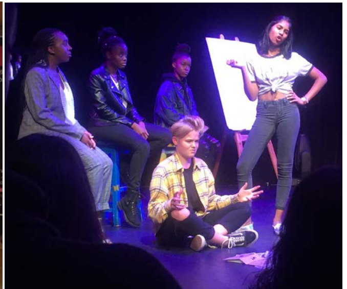
A scene from The Dean Play