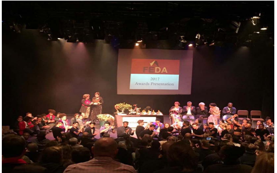
The awards presentation