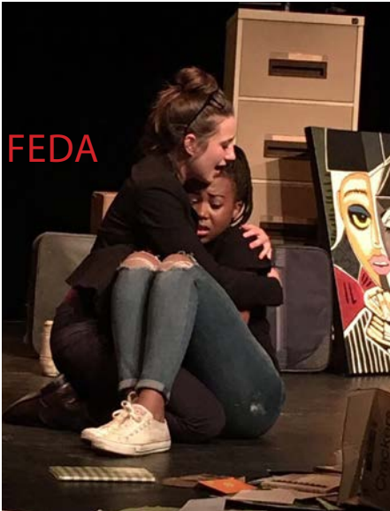
A scene from Anna Weiss