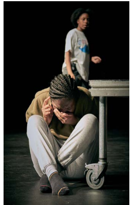
A scene from I Don't Like Monday's