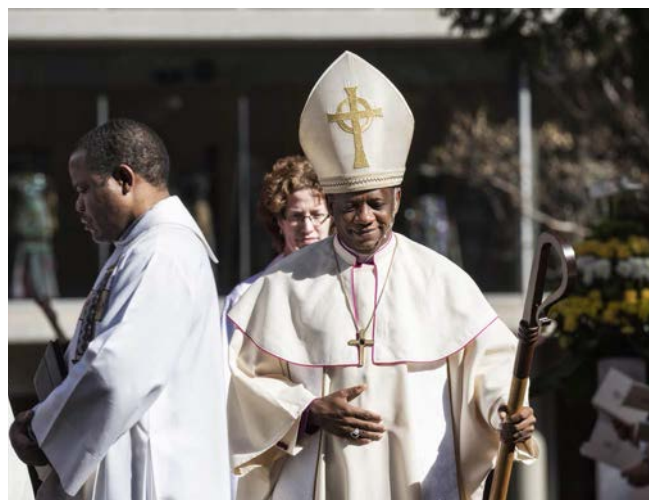
At the Patronal Eucharist