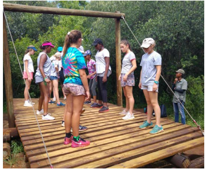
Teamwork on the balancing bridge