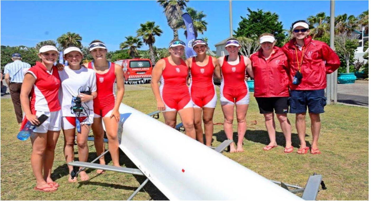
The St Mary's 1 st rowing quad were victorious at the 17 th annual Schools' Boat Race. This marks the school's 11 th victory and the fourth consecutive win. For more information, please see pages 14 and 15