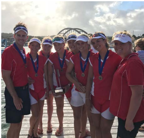
SA Schools' Boat Race champions 2017