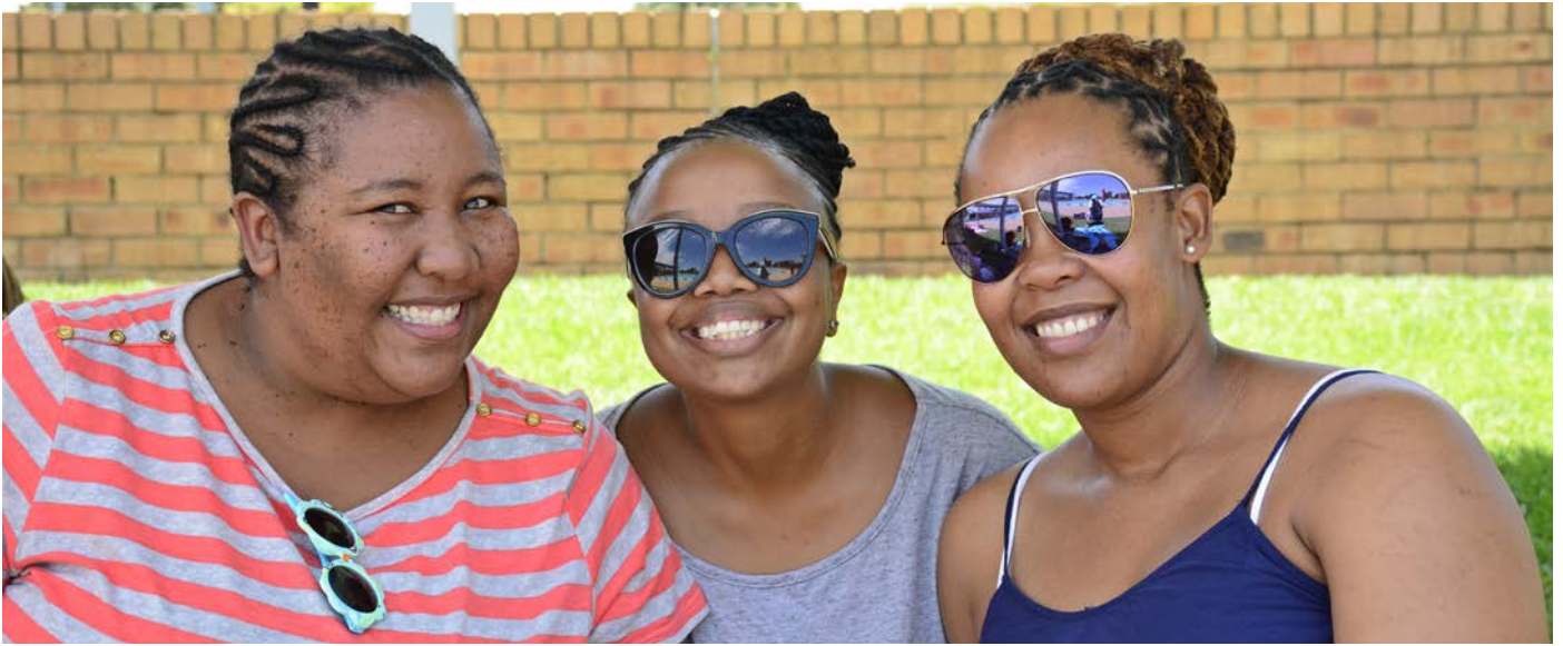
Chilling at the pool