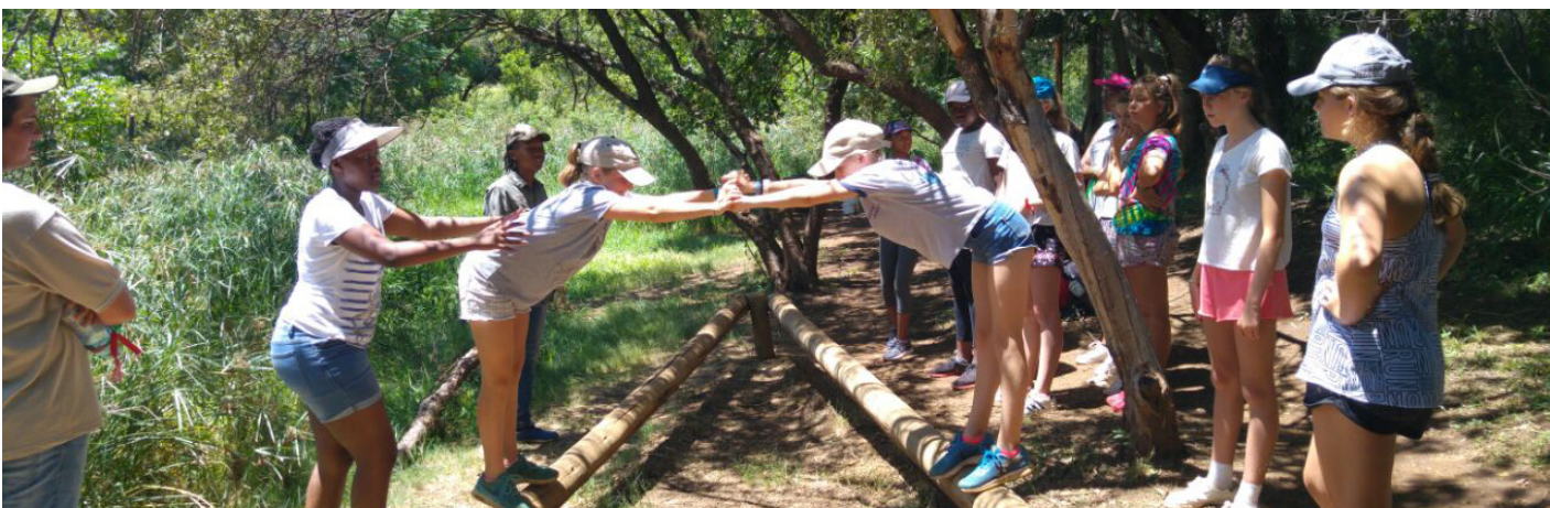
Learning to trust one another

On Tuesday 23 January, 114 Form I girls left in a cloud of anticipation as they travelled to the North West province for four days of adventure, team building and learning about one another. The teachers who accompanied the group commented on the girls' spirit and exuberance. During free time one evening, several girls spontaneously produced a performance of their favourite Abba songs. In true St Mary's tradition, the most anticipated activity was the "mudstacle" course. This highlighted the perseverance, resilience and tenacity of the group. The