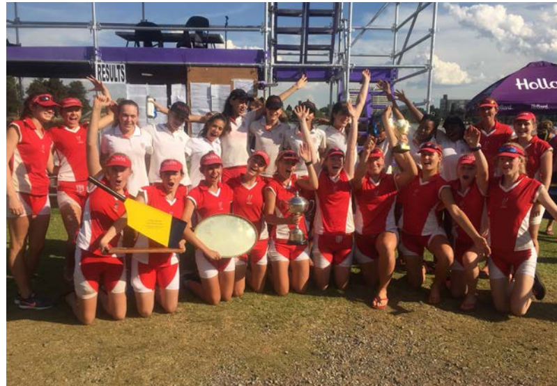
St Mary's seniors showing off their haul of trophies