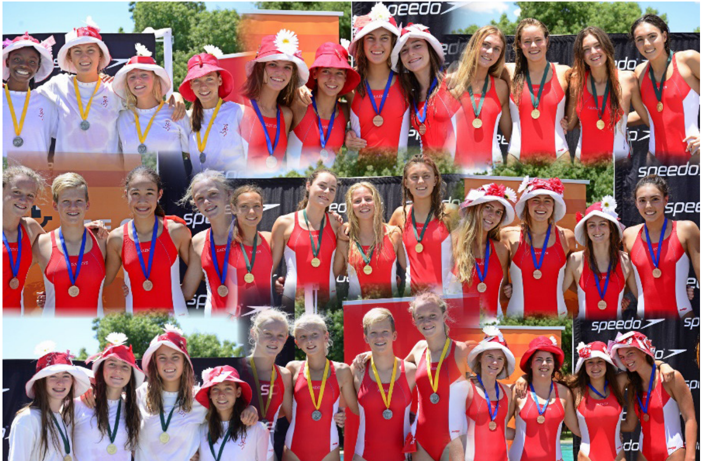
Podium finishers National Aquatics Festival

place we had only one less point than in 2017. There were dramatically improved performances from St Stithians and Our Lady of Fatima. They moved from fourth and seventh respectively to first and third.