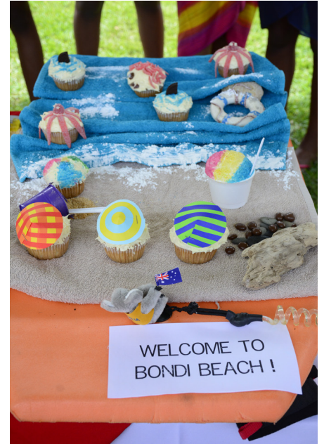
The winning cup cakes