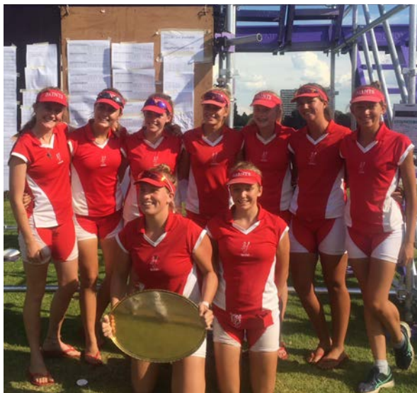
Winners of the women's A eight for the second consecutive year