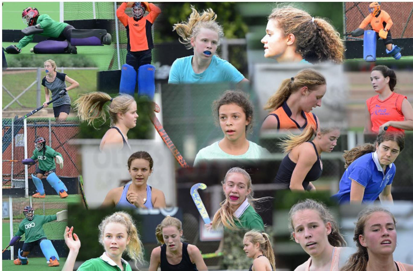
Faces and images from Fast Fives 2017