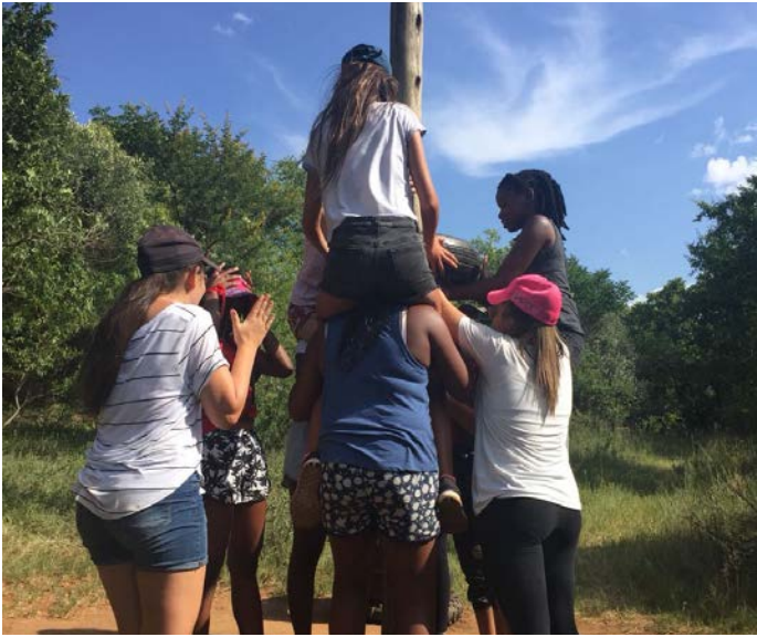
Strategic problem solving