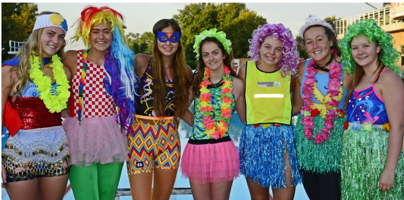
Matrics at Friday warm-up

we are swimming in wonderfully warm water – long may this last.