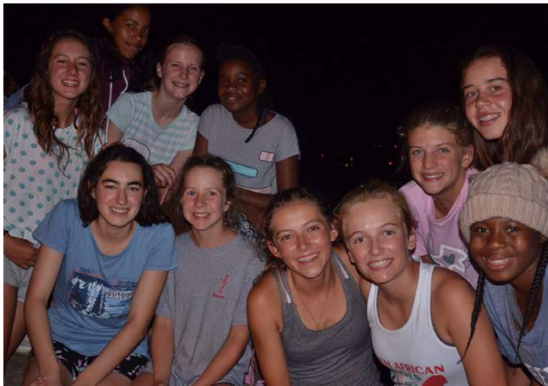
Enjoying the last night's campfire