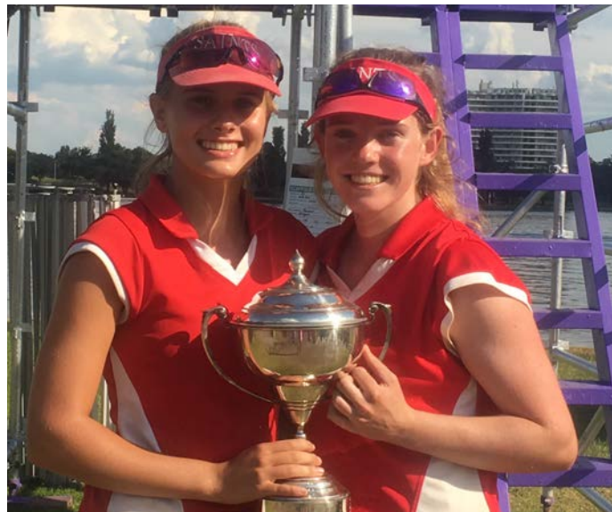
Best junior, senior A, B and C club. This includes boys, girls, men and women overall points