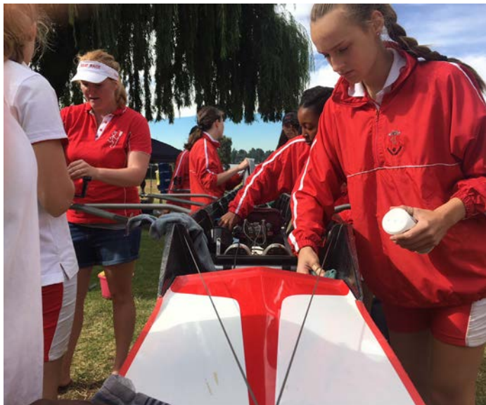
Getting ready for VLC sprints