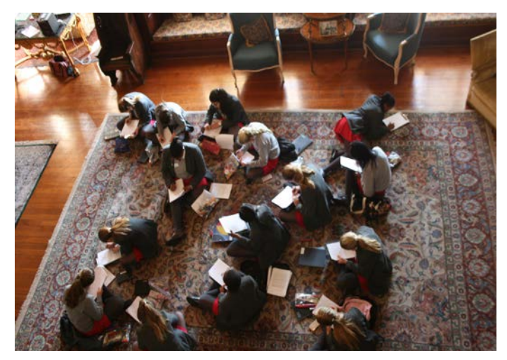
Form Is complete the music practical listening activity in situ, in the Northwards ballroom