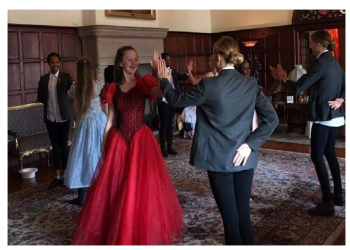
More impressive dance performances