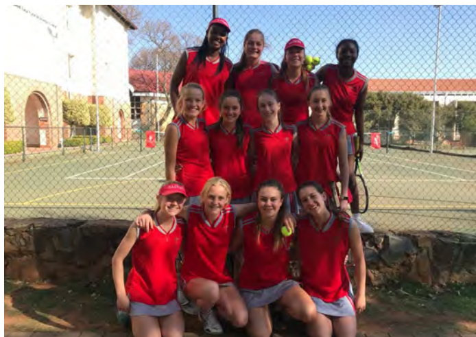
The Form I girls in the GH tennis team who beat St Stithians CD in a convincing manner