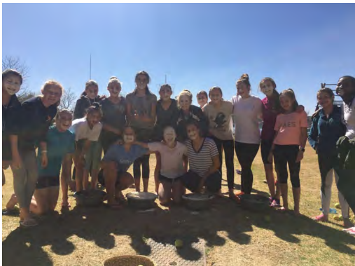
U14s having fun on camp