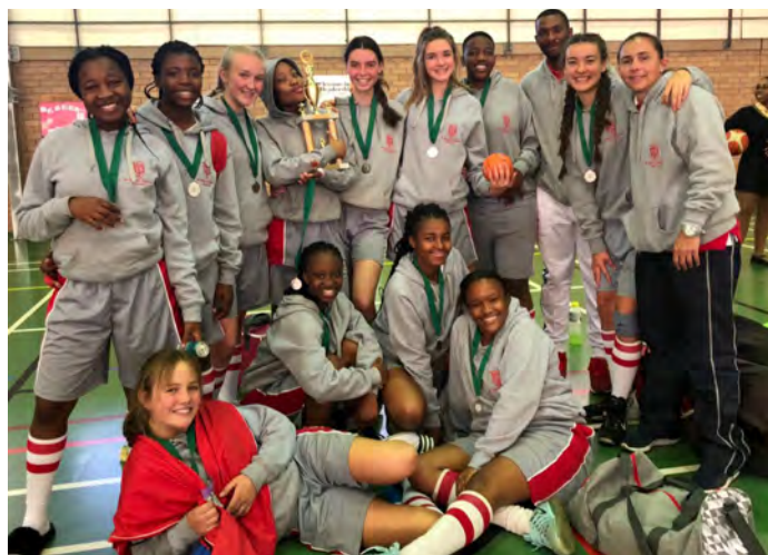
Team with medals and trophy

Our girls went on to win all their pool games. This included positive results against The Wykeham Collegiate, St Anne's, Carter High School, The Glen