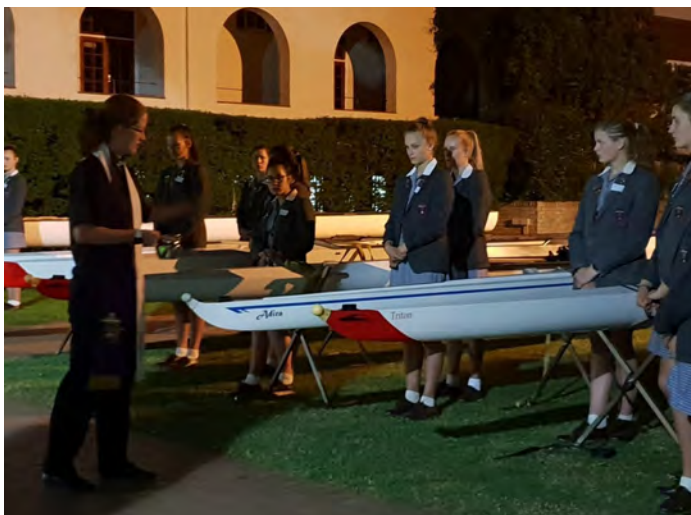
Boat Blessing at the cocktail evening

unwavering support, the dedication of the parents and the girls, as well as the numerous coaches and our head of rowing, whose commitment is unsurpassed by any in the country. We are thankful not only for rowing, the sport, but what St Mary's rowing means to us all.