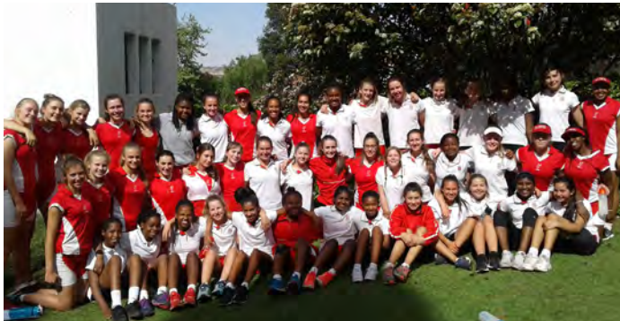
St Mary's rowing club at the indoor ergo regatta