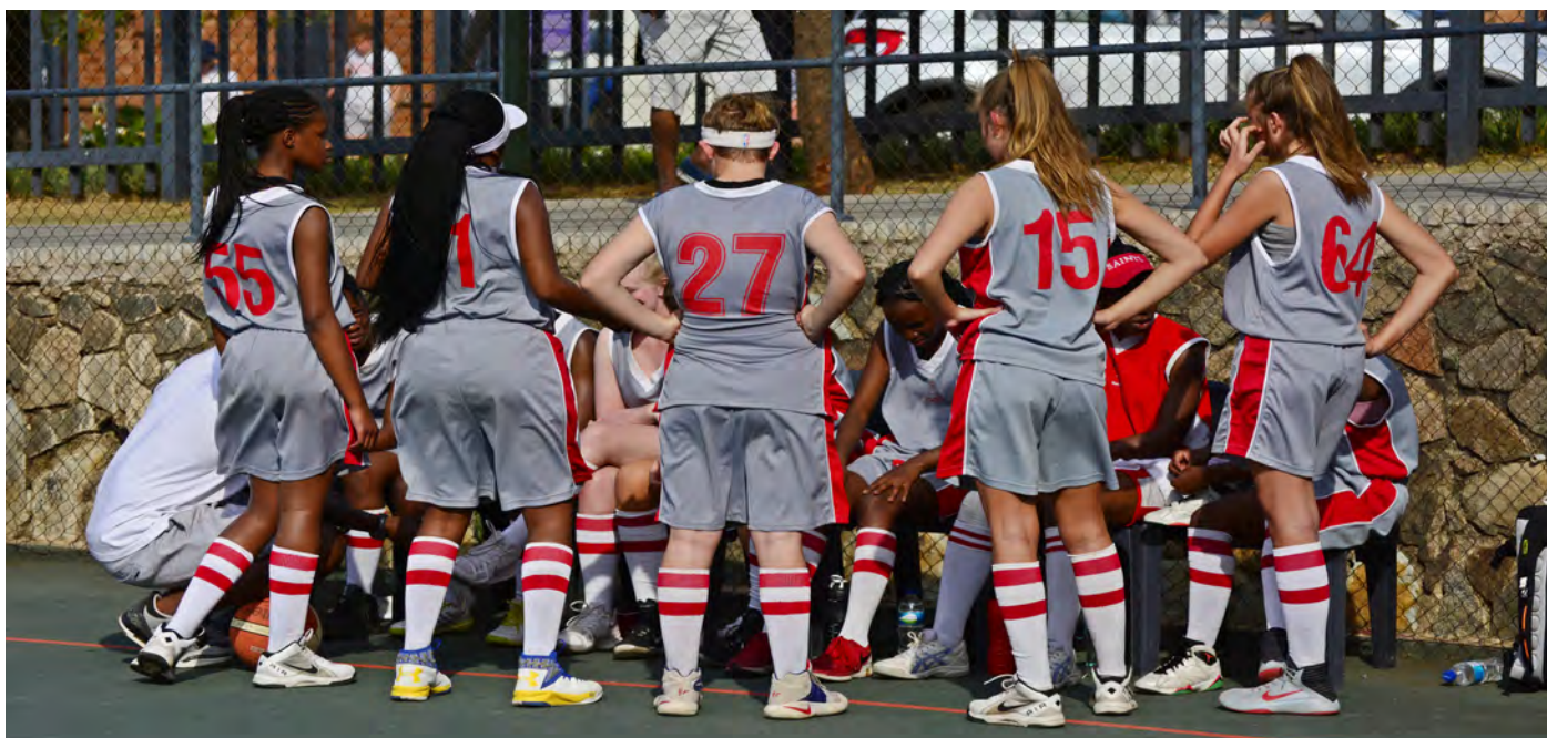
1 st team - St Peter's Tournament