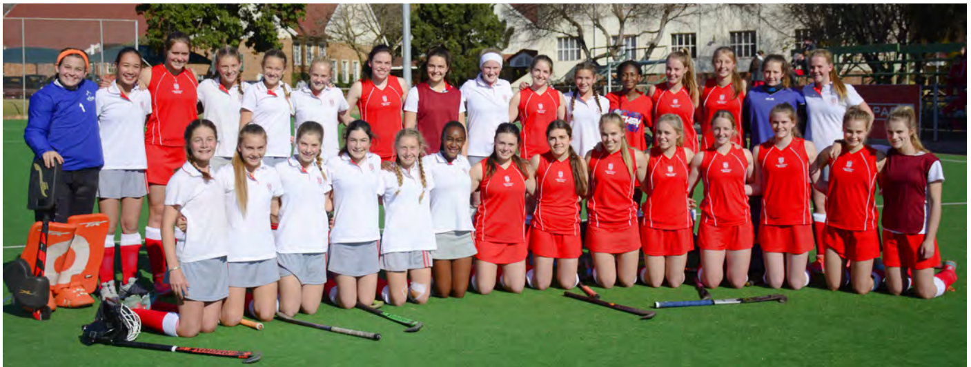
Two of our successful Grays league teams (U14 A and 1 st team after their annual match)

We received the results of the Grays hockey league this week and congratulate all the A and B team players. The 1 st , 2 nd , U16 A, U16 B, U15 A, U15 B, U14 A and U14 B teams all participated in the Grays League. The U15 A team placed second in their section. We won all other leagues and were 73 points ahead of second-placed St Stithians (see results table below).