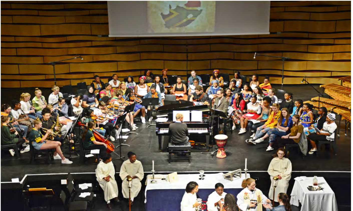
This morning, our Senior School girls celebrated Heritage Day with a moving Eucharist