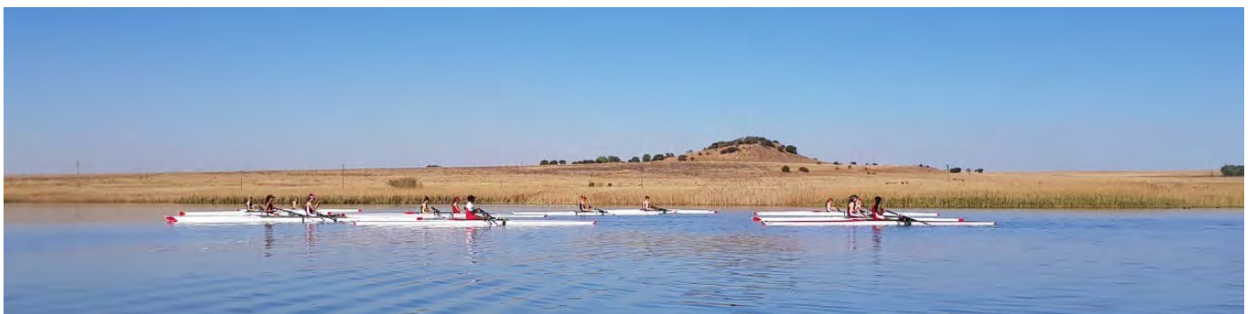
Opens single scullers waiting for the start of the piece

The first regatta of the season, the St Andrew's Ergo Regatta, took place on 15 September. Not only was this the first regatta of the new season, but it was also the first regatta for our U14s. Although this was an indoor regatta, the U14s had their first taste of competitive rowing in a racing environment. The atmosphere pulsed with excitement. The U14s rowed their best throughout their ergo trials and the relays. At the end of the