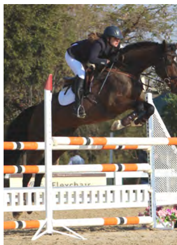
India: second and third places Show Jumping Level 7