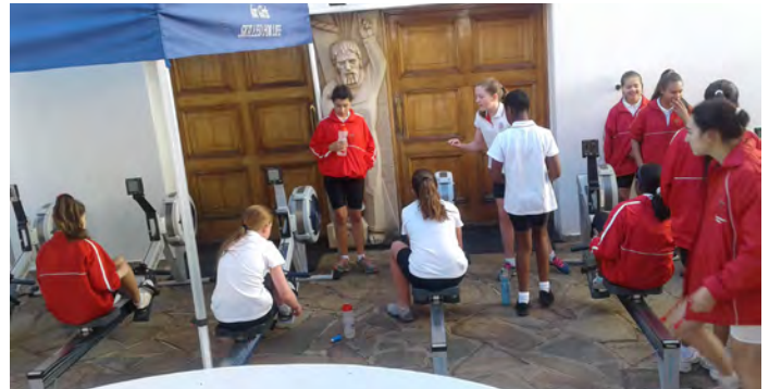
U14 girls warming up at the indoor ergo regatta