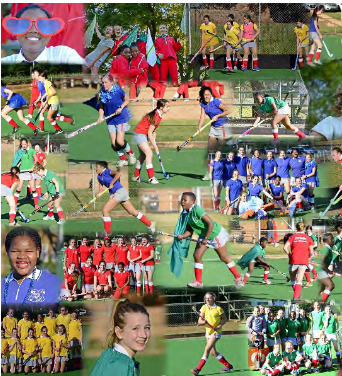
Junior inter-house hockey