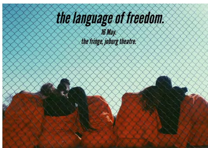
The Language of Freedom

This year, we entered three very different plays into the FEDA festival and, once again, our Drama pupils did themselves proud! Certificates were handed out at assembly on Friday 6 July.