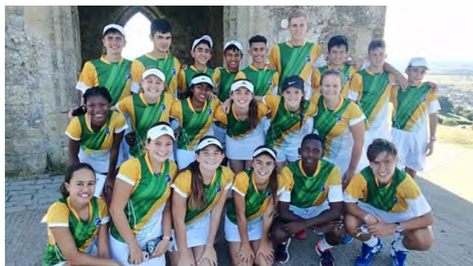
With the SA Schools' tennis team