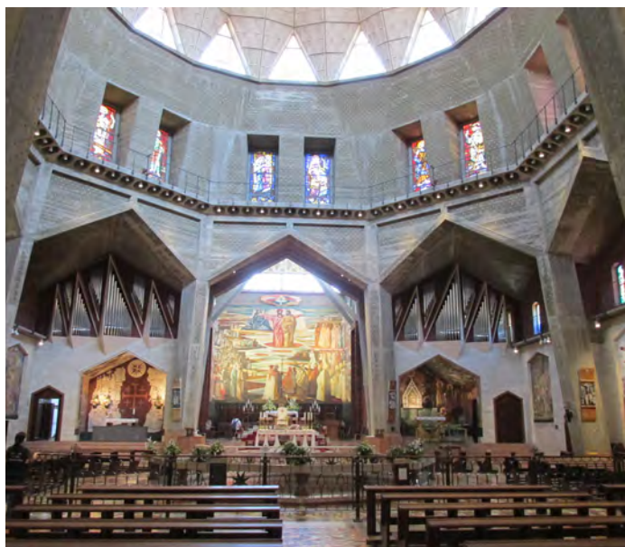
Inside the Church of the Annunciation, Nazareth