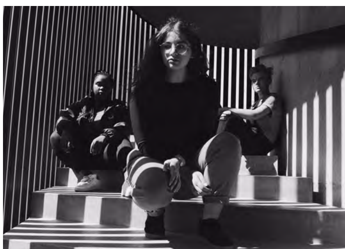
Boys will be Boys

The second play we entered was Boys will be Boys , a new play by