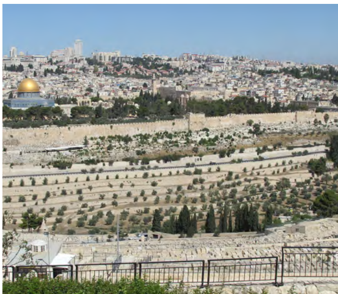
View of the Old City of Jerusalem from the Mount of Olives