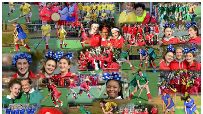
Senior inter-house hockey