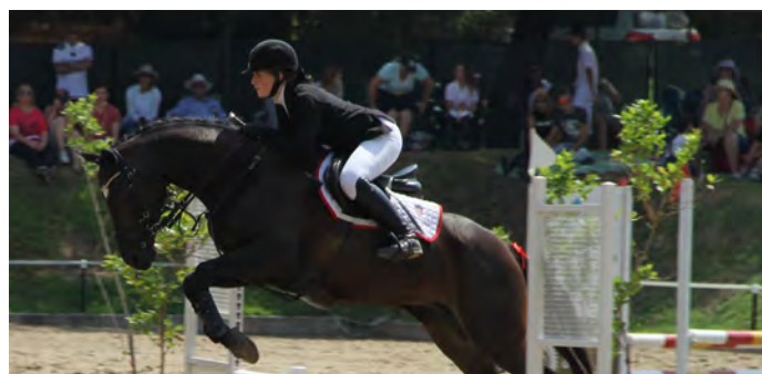
Kiara – showjumping