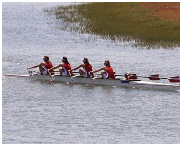
1 st crew moving round bow side corner in the heads race

Getting the chance to participate in the SA Schools' 2018 Boat Race was an absolute privilege. It was an experience that the six of us will treasure.