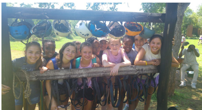
All aboard the zip line express