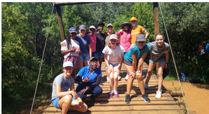
Teamwork and friendships