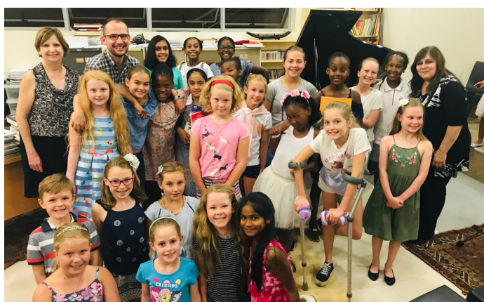
Junior piano students and teachers