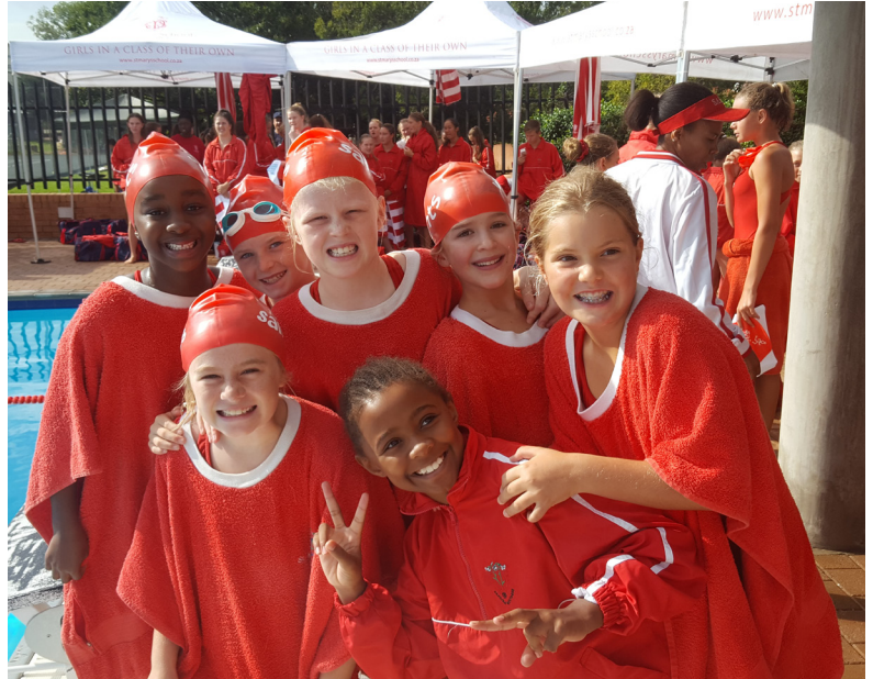
Winners of the 2018 SA Schools' Boat Race and winners of 2019 Summer Splash gala – St Mary's, Waverley