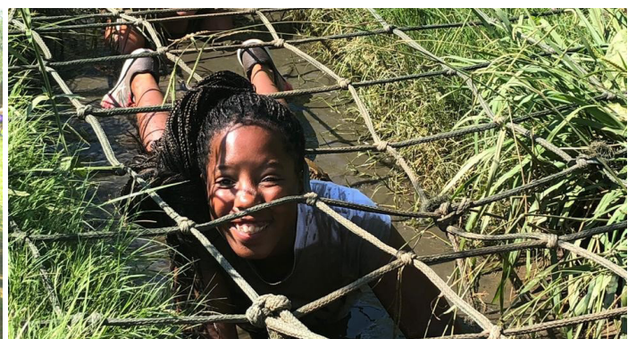
The tunnel of terror