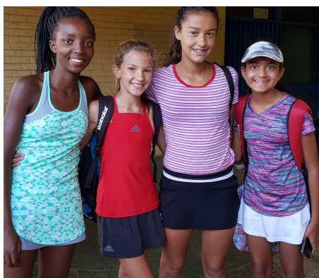
New Form I players who participated in the Gauteng trials