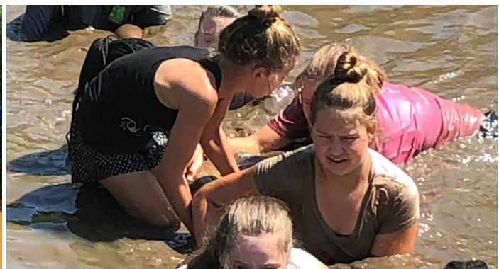
Getting down and dirty in the mudstACLE course

Last week, the Form Is concluded their orientation programme with a four-day team-building exercise at Konka Camp. Spirits were high and the girls participated enthusiastically in all the challenges. Highlights included the much-anticipated mudstACLE course and the hotly contested potjie competition. One of the winning groups, the feminist X-Women, used a glug of Coca-Cola as their secret ingredient. Snack time proved to be a treat, with offerings of freshly baked chocolate muffins, trays of tempting biscuit assortments and wedges of cool watermelon. With temperatures soaring to 37 degrees, the monster-sized pool provided welcome relief.