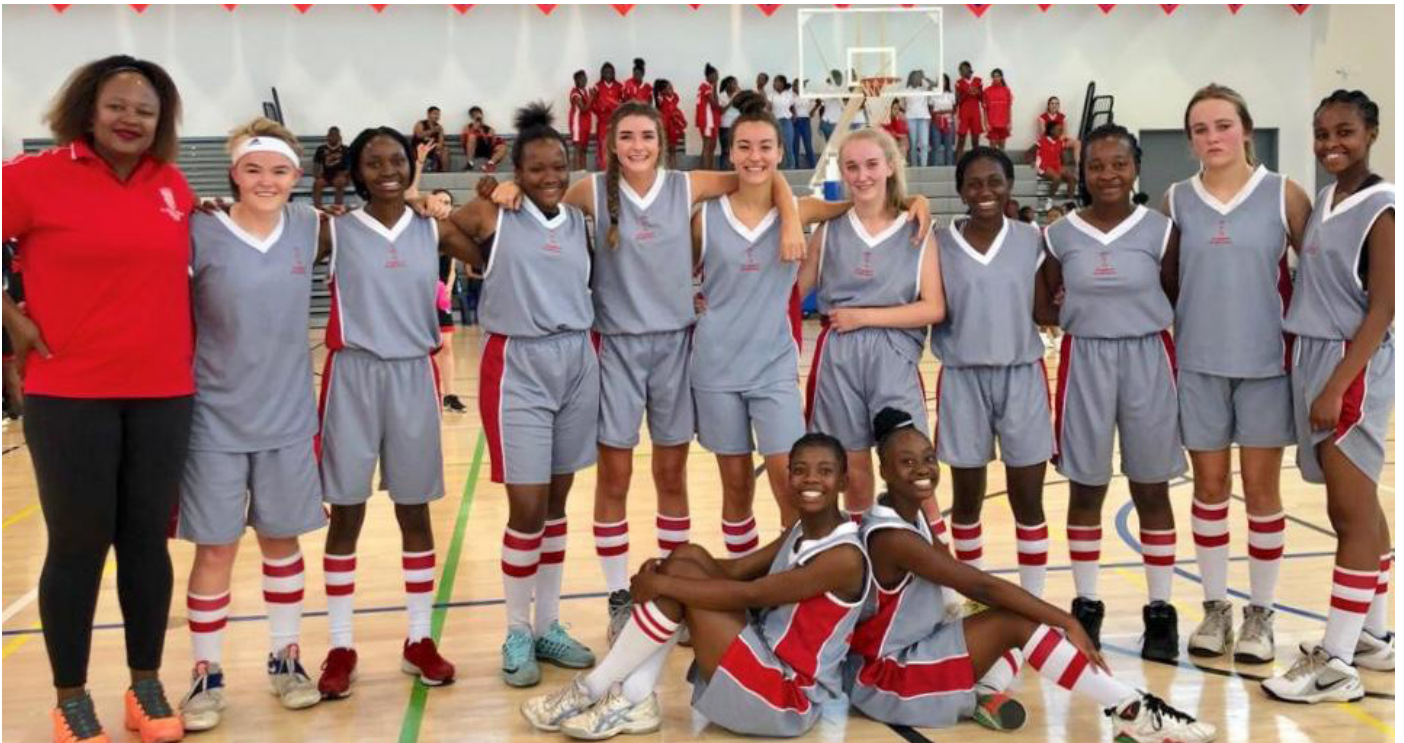
1 st basketball team with their coach

Two very excited St Mary's teams participated in the AISJ basketball tournament from 24 to 26 January.