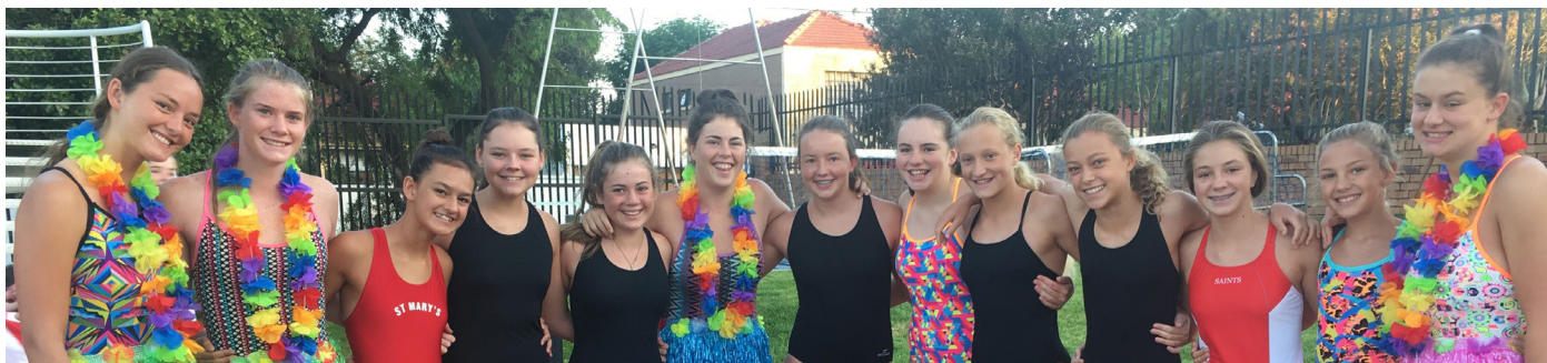
Matrics and Formies at the first early morning session