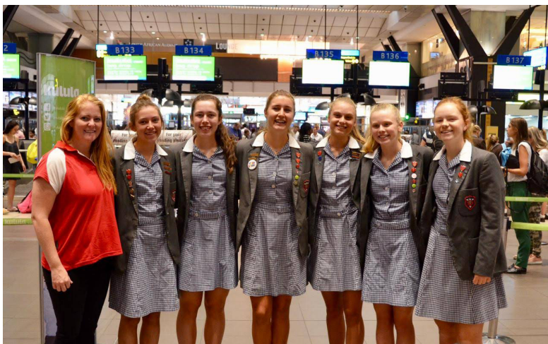
Boat Race Squad