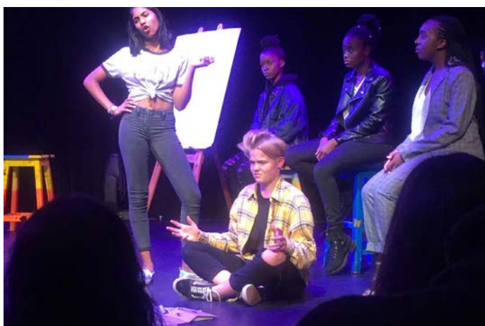
Scenes from The Dean Play

The Original Works section play, The Dean Play , was warmly received last Tuesday night at FEDA, and after the semi-finals, have made it through to the overall finals of FEDA 2017.