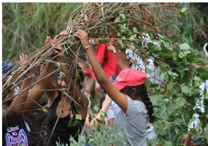
Girls helping to remove crofton weed from the riverbanks

In the April holidays, the Form IV Life Sciences girls went on camp to Maretlwane. It was a successful camp, as we applied our classroom knowledge of animal and plant diversity and classification to the reality of the bush. We participated in many activities, including estimating the population size of a grass species and measuring the biomass of the invasive alien, crofton weed.