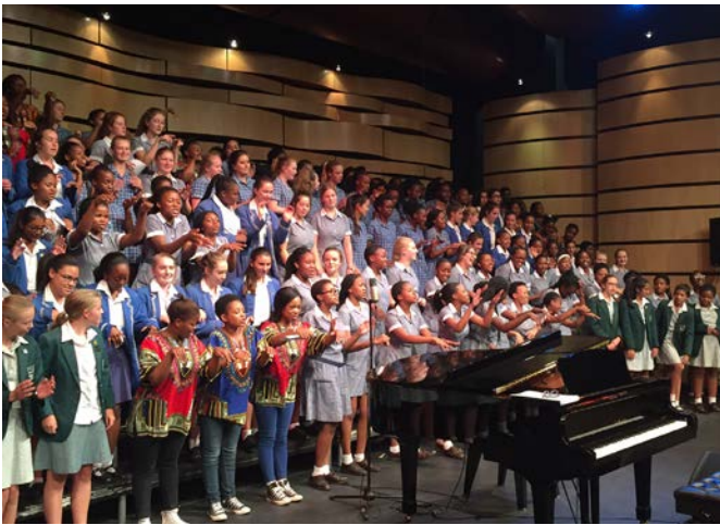
Combined choirs at Singing Sistas

Singing Sistas is an annual choral music festival that is hosted by the St Mary's Music department. Last term we enjoyed two evenings of music, which allowed choirs from various girls' schools to share their choral programmes. The philosophy of the Singing Sistas festival is not to compete, but to present each school's talent and nurture camaraderie