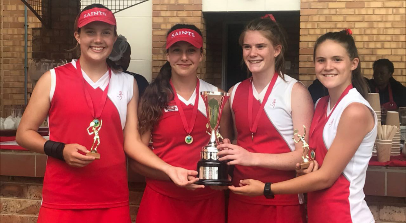
Winners of the A inter-high tennis: St Mary's has emerged victorious in this tournament, involving 28 schools, for the fourth consecutive year