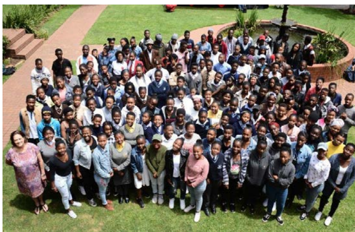
Pupils who registered for the 2018 Ikusasa Lethu Programme

Our class of 94 matriculants achieved a 98% pass rate, with 61 distinctions and 80% Bachelor degree passes. Fifty-five boys and girls from this group are enrolled to study at universities and colleges in South Africa.