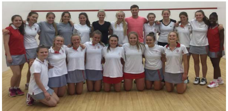
Senior squash girls on camp