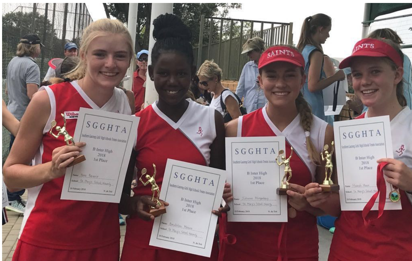
B inter-high winning team

It has been a busy few weeks on the tennis courts at St Mary's. The league matches are being played on Tuesdays and both the St Mary's Senior (Forms III, IV and V) and Junior (Forms I and II) School championships are being played during the practice sessions. Over the past two weekends, many St Mary's players participated in the Gauteng Central school trials and in the annual A and B inter-high competition.