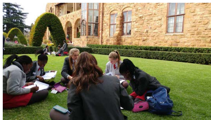
Working in teams

As part of the e4 curriculum, the Form I girls went on an outing to explore the Northwards Mansion on the Parktown Ridge, to experience the life and times of Johannesburg's early mining magnates.