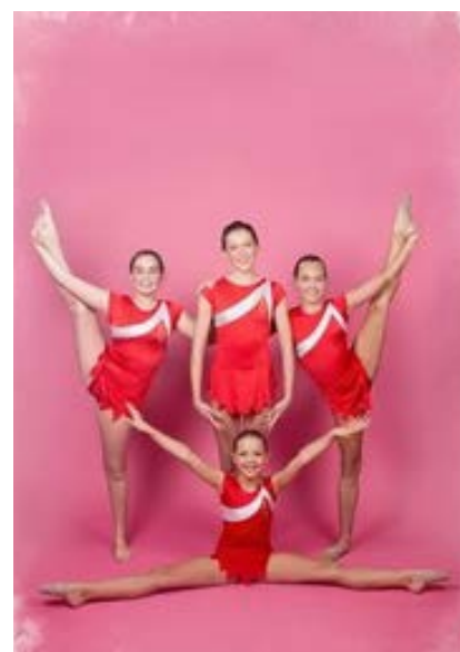
Two Senior School girls and two Junior School girls at the Toccata Invitational, at Toccata in Pretoria on 28 May