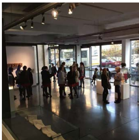
Matric Visual Arts girls discussing the exhibition