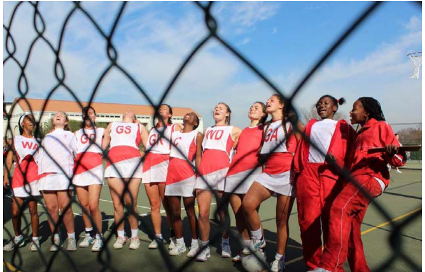
Our 1 st team passionately singing their war cry after our match against St Andrew's School