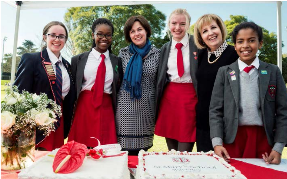
At the Patronal Festival, celebrating our 128 th birthday