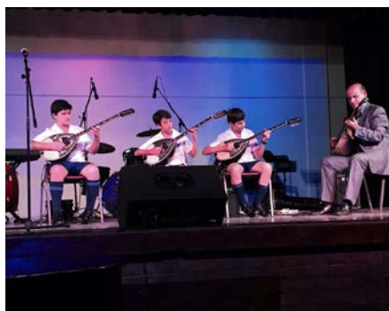
SAHETI bouzouki ensemble

This year the St Mary's jazz band, saxophone ensemble and rock band Third Millenium all graced the stage with their musical presence, passion and - as the Greeks would say it - zontania .