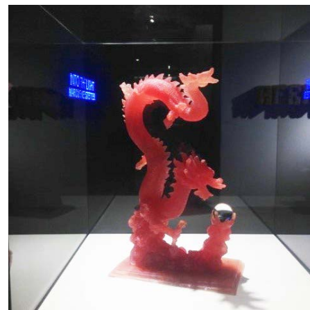
Glow stick Dragon