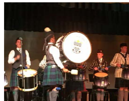
Jeppe's pipe band in action