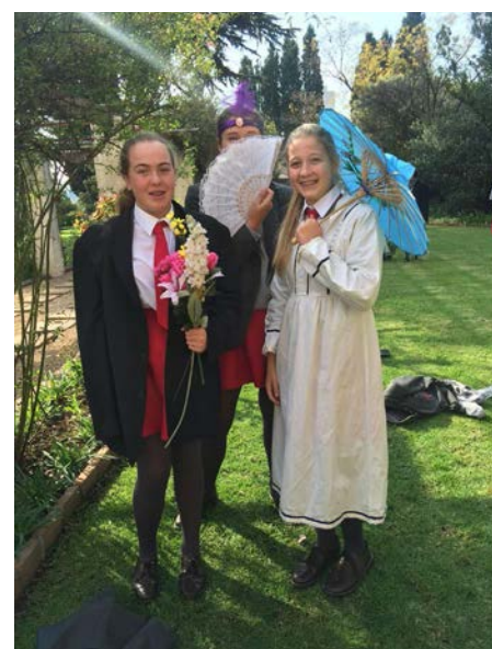
Role-playing scenarios in the early 1900s