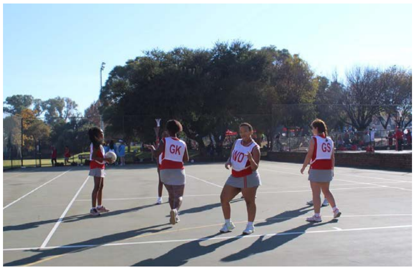
The U16s warming up for their match

On 25 May our netball girls played Leeuwenhof Akademie Hoërskool. All the games were really tough, and our girls played well.