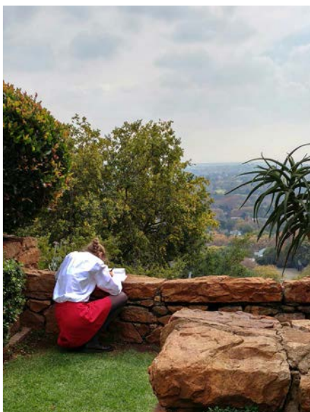
Drawing a field sketch