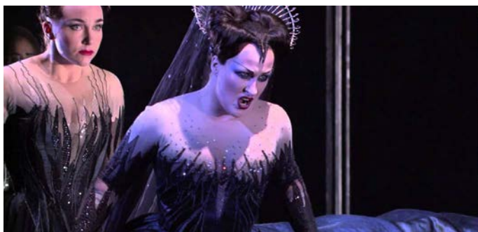
Queen of the Night

On Thursday 19 May, the subject Music girls were lucky enough to see a live production of Mozart's The Magic Flute . It was definitely an incredible learning experience, as well as a lovely evening out together.