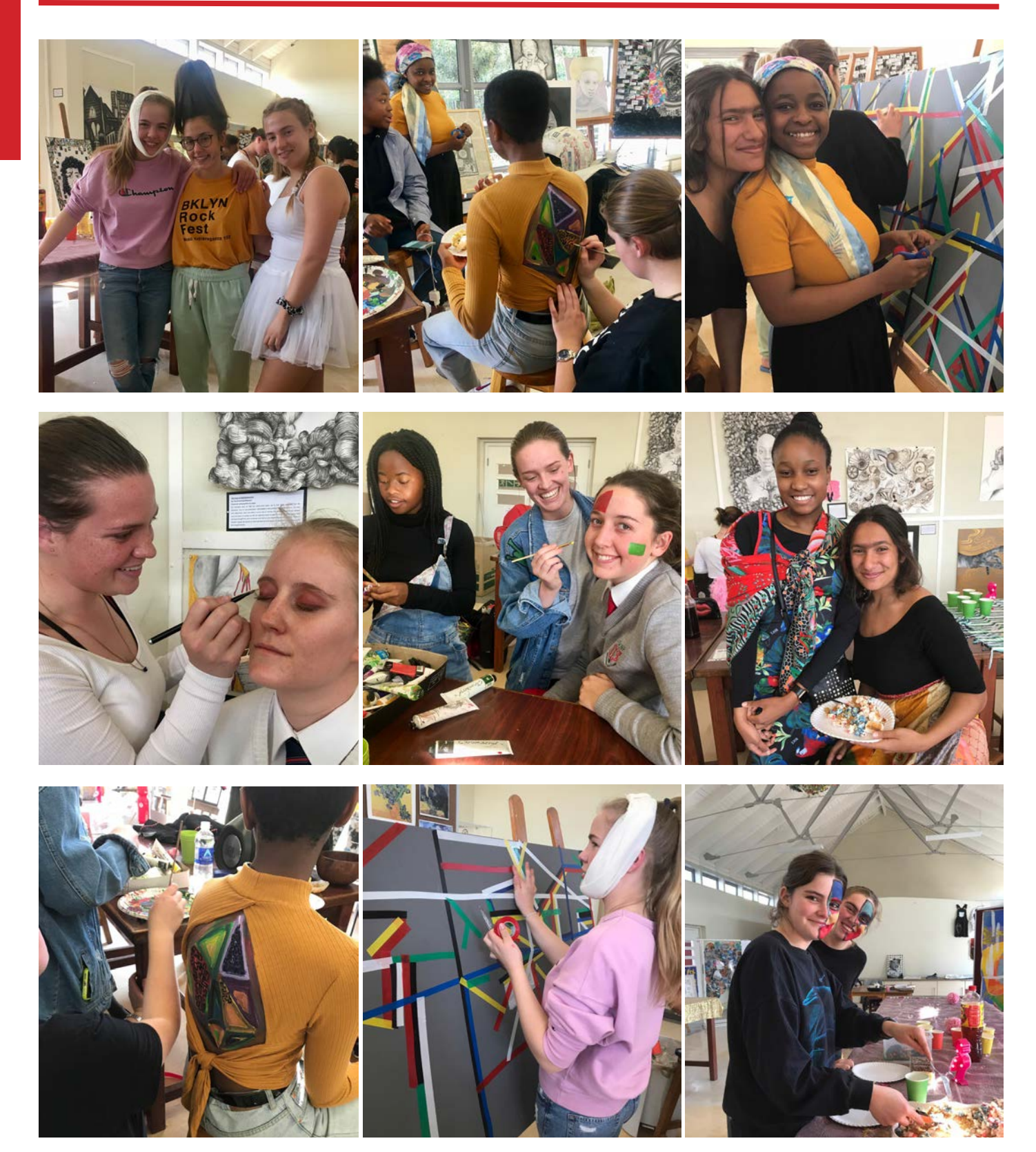
The Form III to Form V Visual Arts girls had fun at an "Arty Party" held in the art studio at the end of the second term. The girls dressed up in "arty gear" and ate creative food. They all participated in creating the artwork.