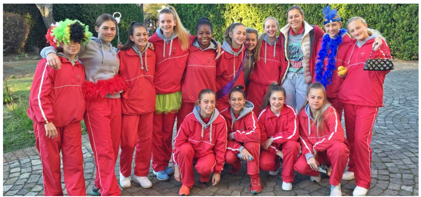
U14 A team