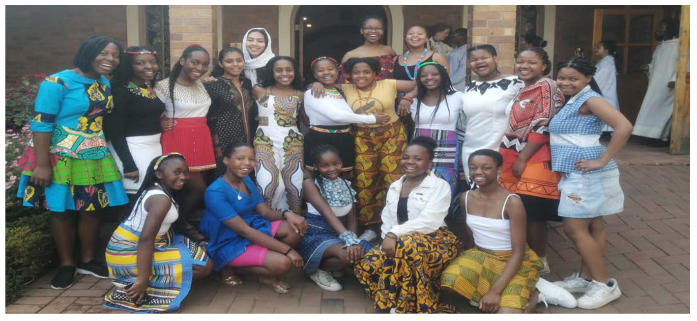
This morning, a celebratory Eurcharist was held for Heritage Day

Tel: 011 531 1800 | smsenior@stmary.co.za | www.stmarysschool.co.za