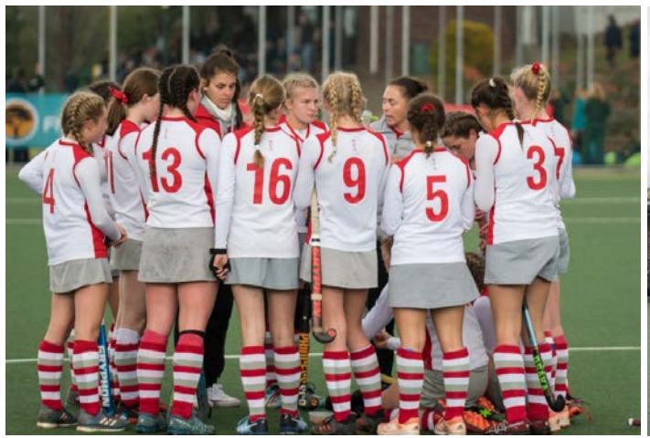
Pre-match team talk

The St Mary's U16A hockey team finished second in the prestigious Top 12 Tournament, after losing a hard-fought final 0-1, to Oranje Meisieskool from Bloemfontein.