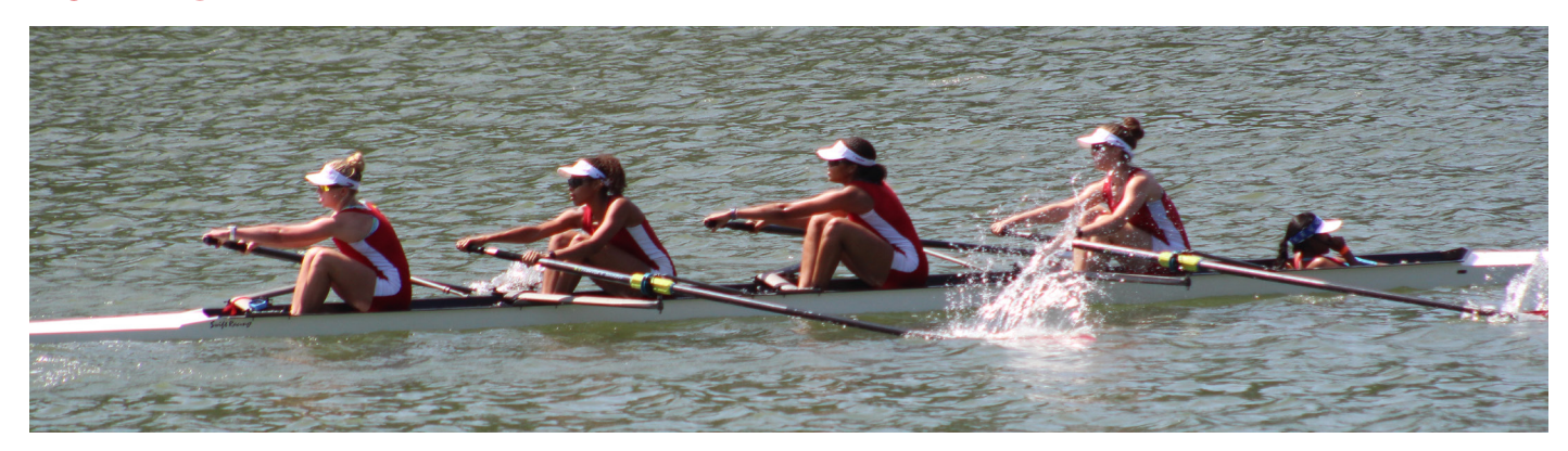
St Mary's 1st four claiming gold