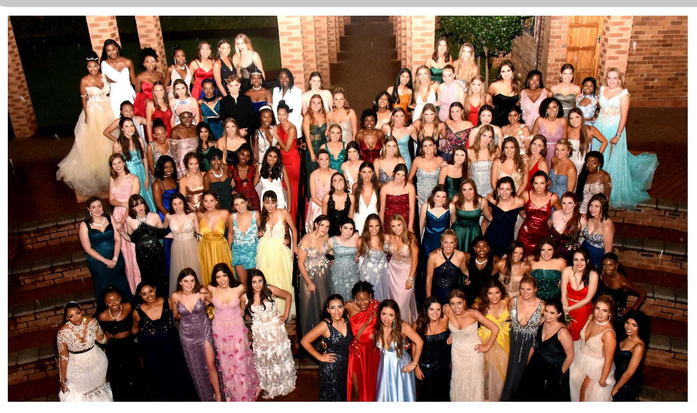
The girls looked beautiful at the 2020 matric dance

Tel: 011 531 1800 | smsenior@stmary.co.za | www.stmarysschool.co.za