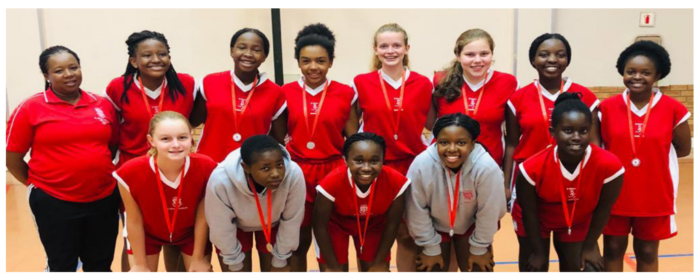
U15 basketball team