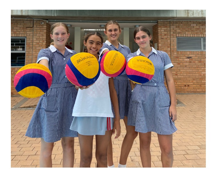
SA team selection