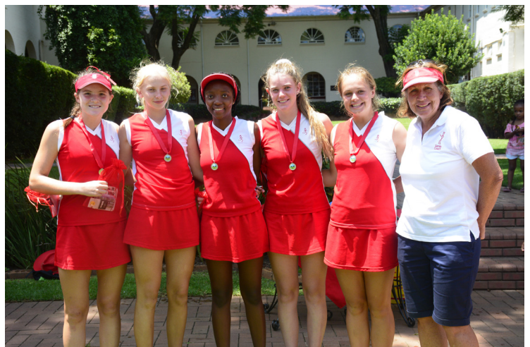
The St Mary's 1st team won silver medals at the St Mary's Invitational Festival