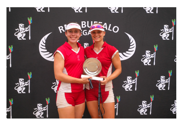
St Mary's captains winning the 1st pair at the Buffalo Regatta

Last week, the St Mary's Open age rowing group travelled to East London to compete in both the Buffalo Regatta as well as the Selborne Sprints on the Buffalo River. After weeks of training and much excitement, the girls arrived in East London ready to race.