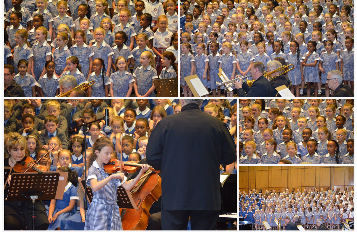
The Sound of Children