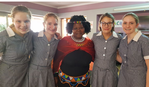
A small group of Grade 7s visited the residents at Waverley Gardens Memory Care on Wednesday 26 September. The girls interacted with the residents and handed out beautiful bunches of flowers that were donated by our Grade 4 to 7 girls. Thank you to everyone for their generous donations.