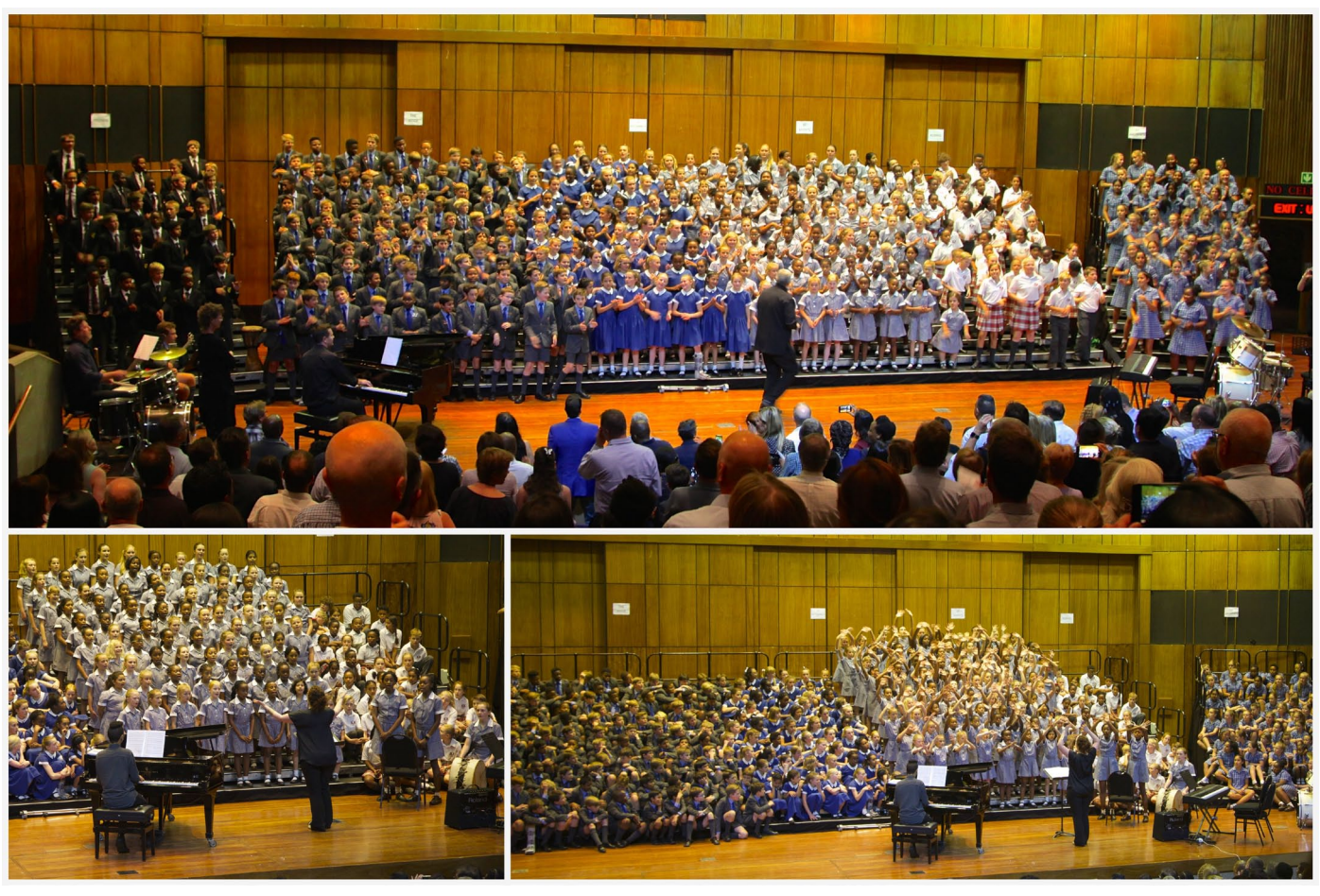
The Ridge Choir Festival