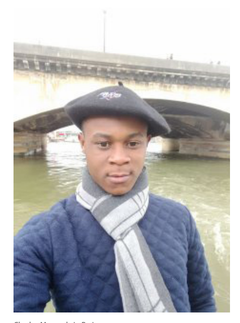
Charles Masegela in Paris