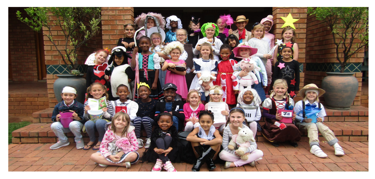
The Junior Primary book character parade was a huge success last term