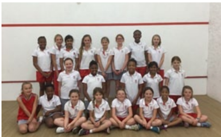
A few of the squash girls enjoyed a Monday session