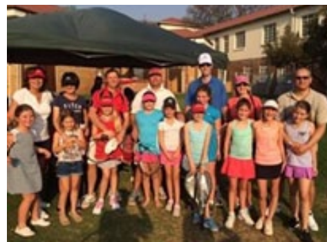
On Saturday 10 September: many tennis players and their moms or dads had a wonderful afternoon of social tennis