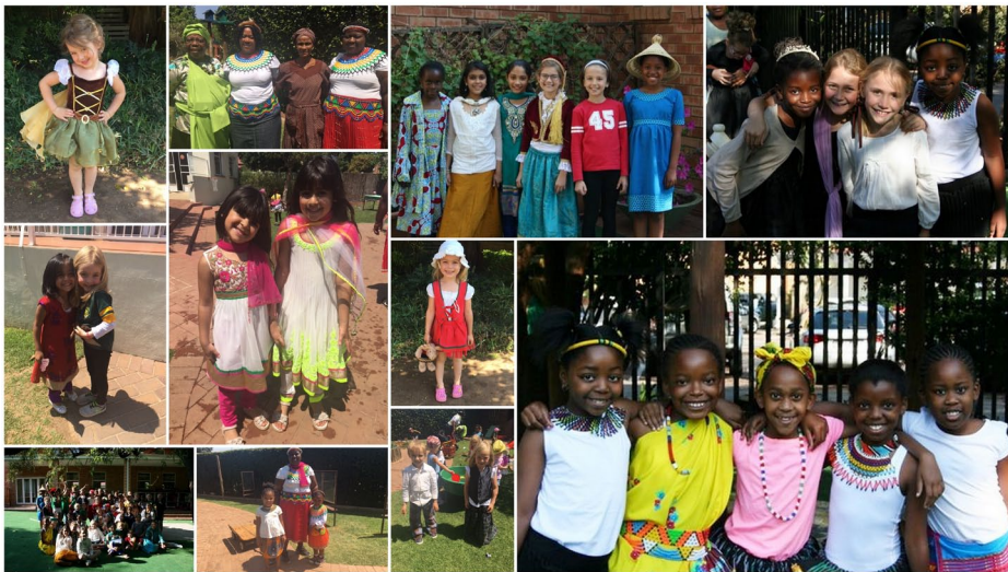
Heritage Day celebrations