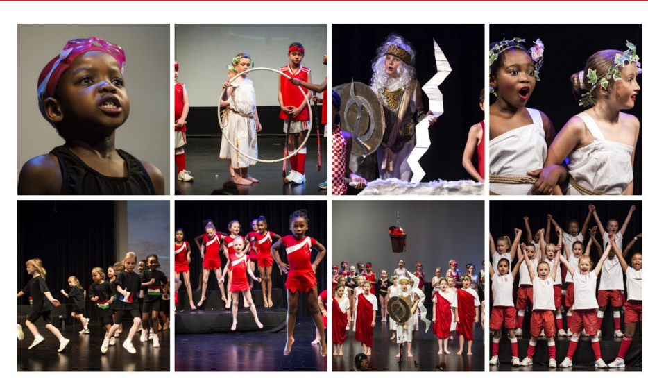
Scenes from Reward of the Rings