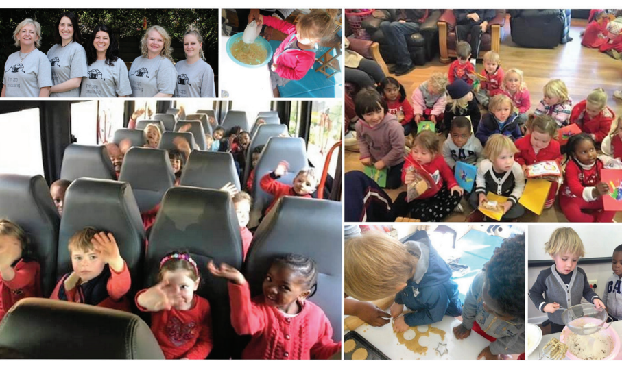
Mandela Day at Little Saints