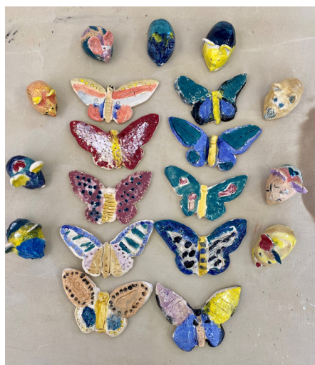
Grade 0 butterflies and mice