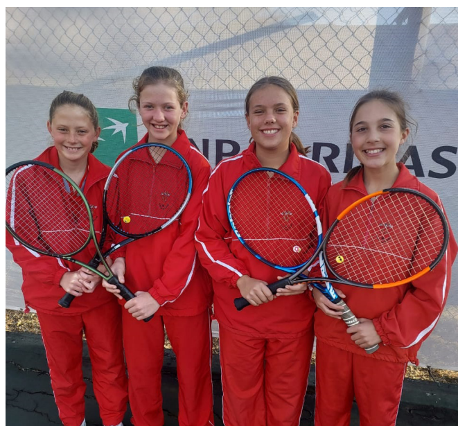
Rising Stars B team