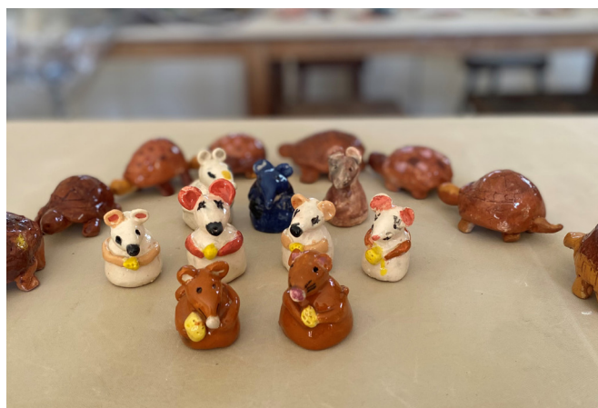
Grades 1 and 2 mice and tortoises