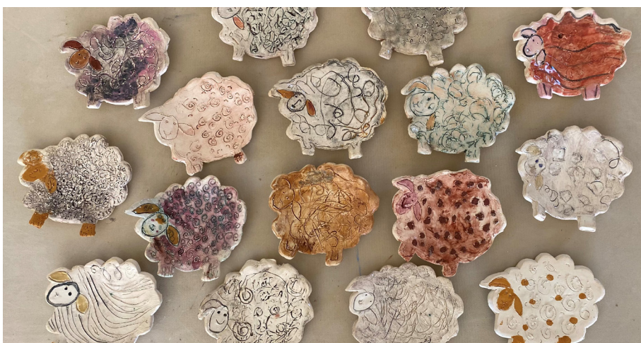
A flock of sheep