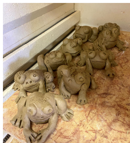
Frogs being loaded into the kiln