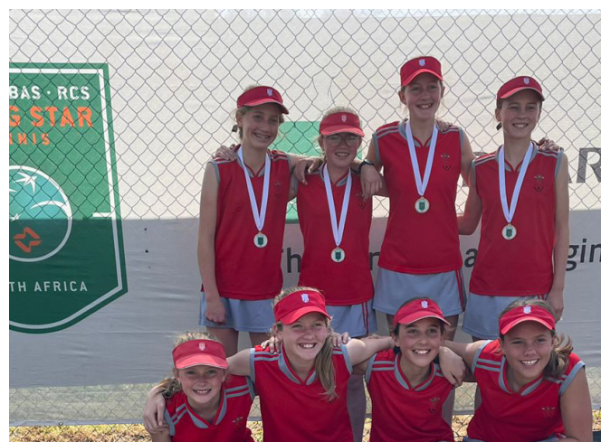
Rising Stars AB team