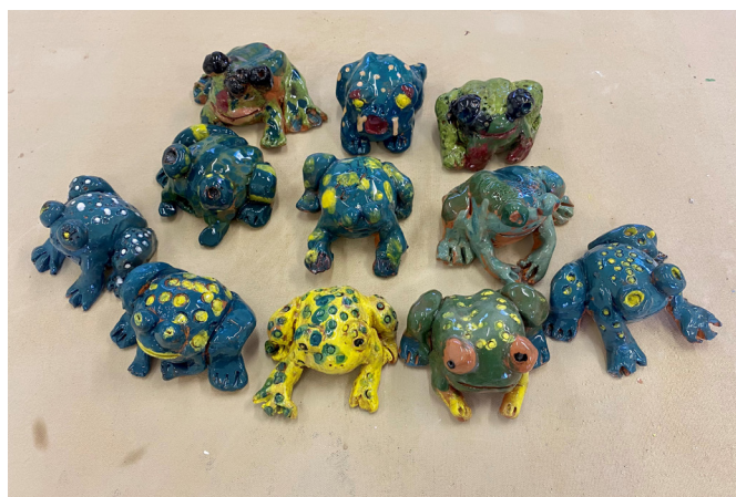
Grades 1 and 2 frogs