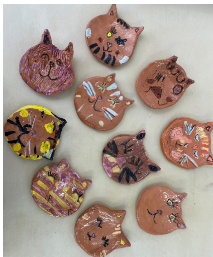
Grade 0 cats