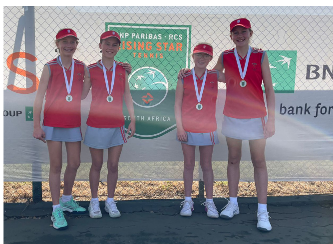
Rising Stars A team