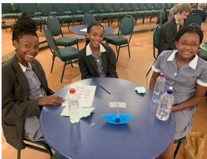
General Knowledge quiz