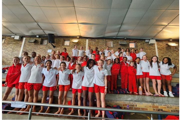
C and D team