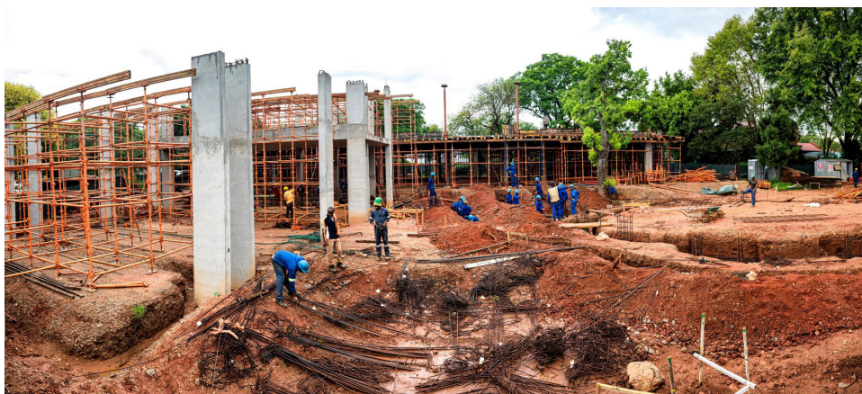
Images of the new building