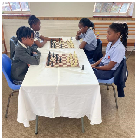
Which move to make next