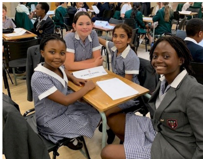
Kid's Lit quiz