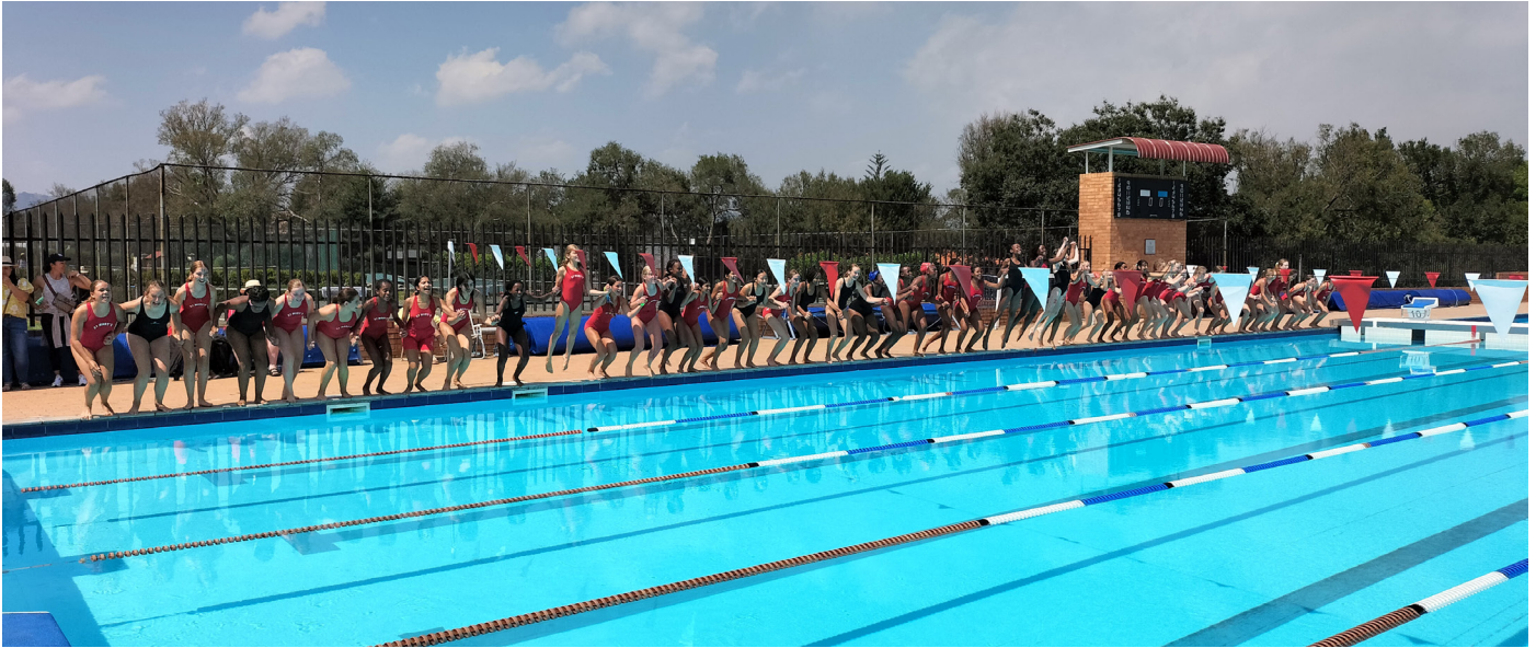
Senior Primary inter-house gala