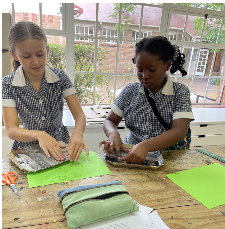
Grade 5 girls making trays out of recycled cardboard boxes