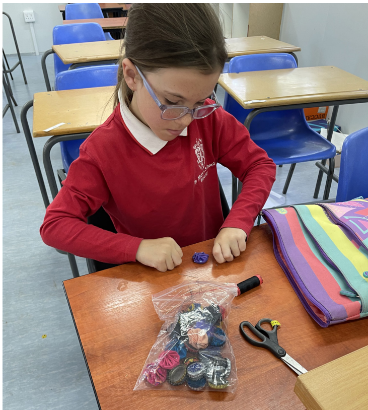
Grade 4 girls making trivets/pot stands out of recycled bottle tops