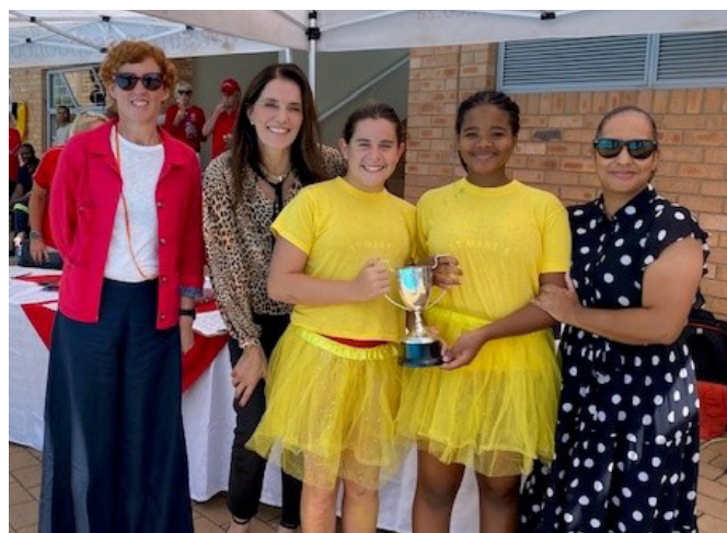
Winning Hares house captains receiving the Shelley Reid trophy