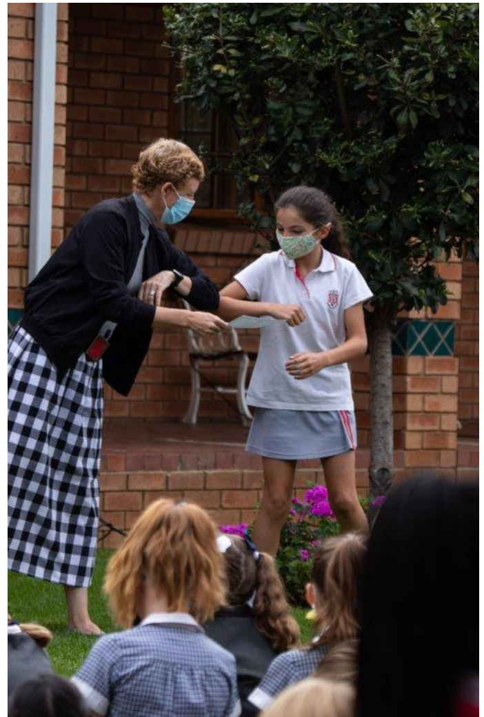
Junior School combined first assembly of 2022