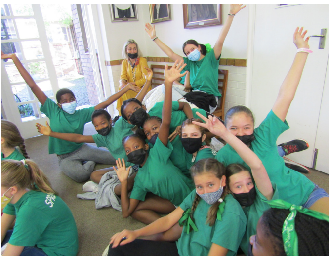
Inter-house literature quiz