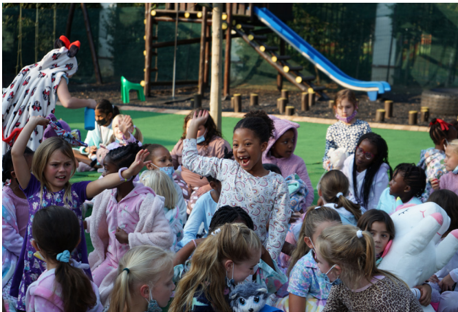
Junior Primary storytelling evening