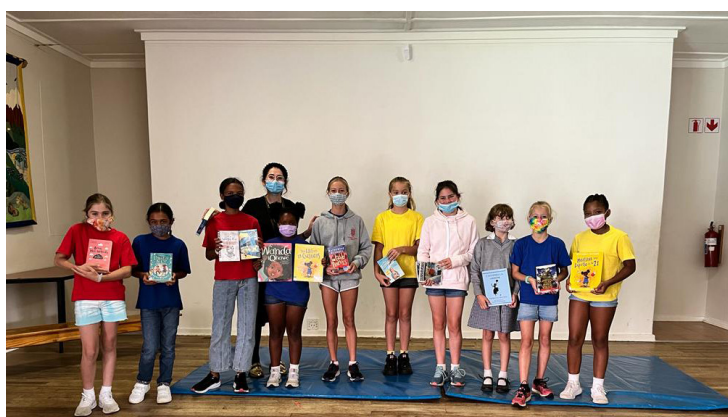
Senior Primary birthday books