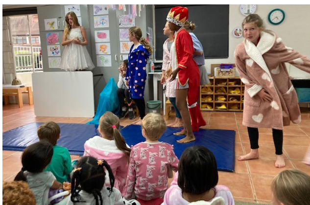
Storytelling evening at Little Saints