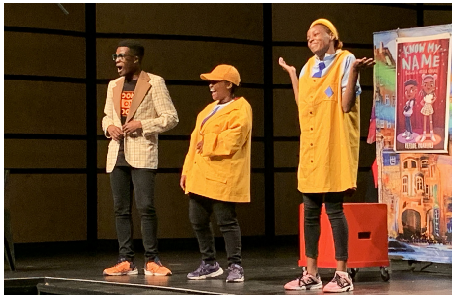
Hooked on Books performing for the Junior Primary