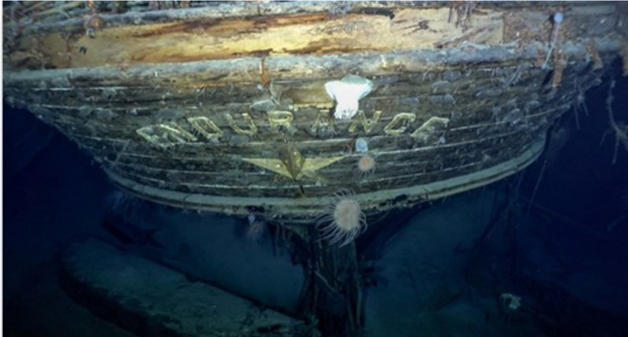
The wreck of Sir Ernest Shackleton's ship, Endurance , has been found 107 years after it became trapped in sea ice and sank off the coast of Antarctica.