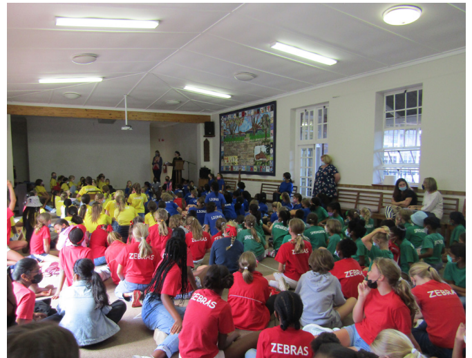
Inter-house literature quiz