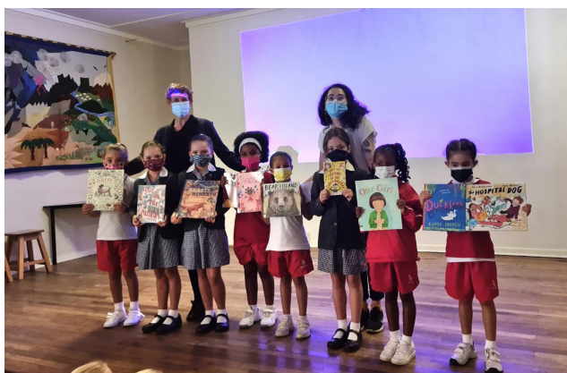
Junior Primary birthday books