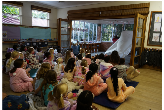
Junior Primary storytelling evening