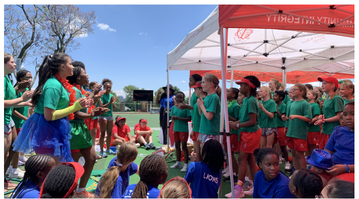
Springboks' war cries