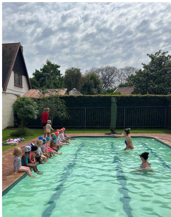
Little Saints children being introduced to the learn-to-swim pool