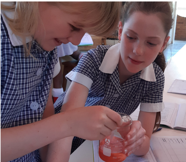
Is the solution saturated?