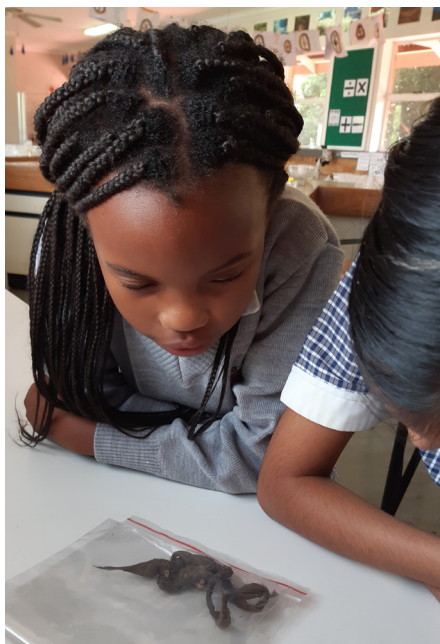
Having a close look at the scat of a snouted cobra. The fur remains from its last meal, most likely a rat, is clearly visible