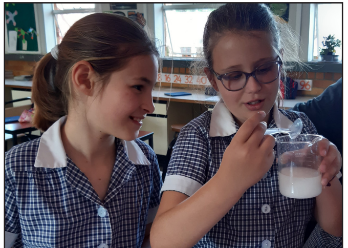
It's definitely soluble