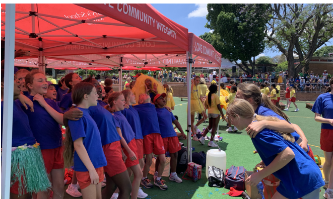
Lions' war cries