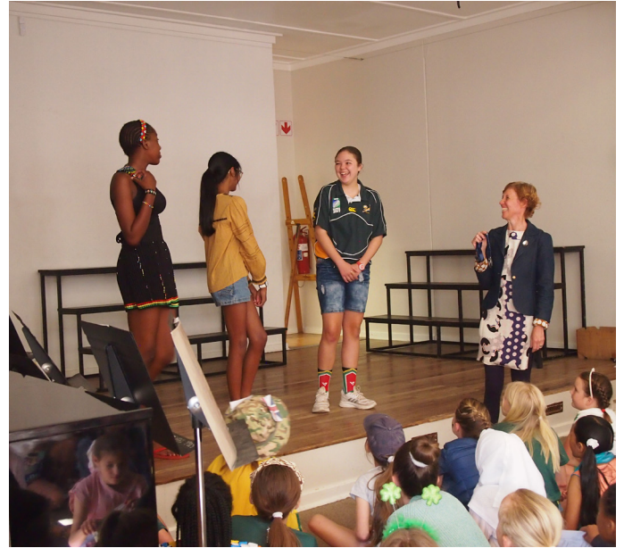
Junior School weekly assemblies