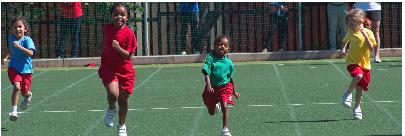
Grade 0 sprint race