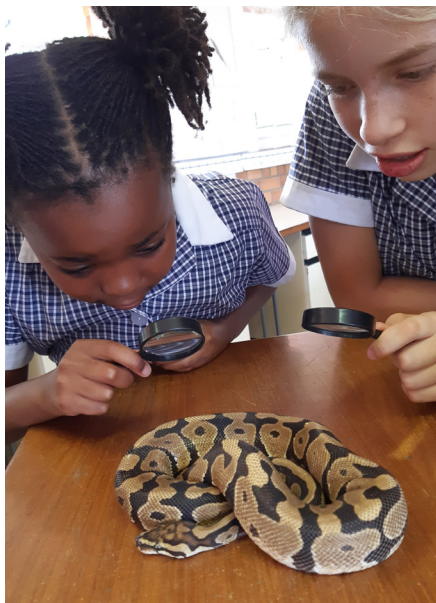
Observing the smooth scales