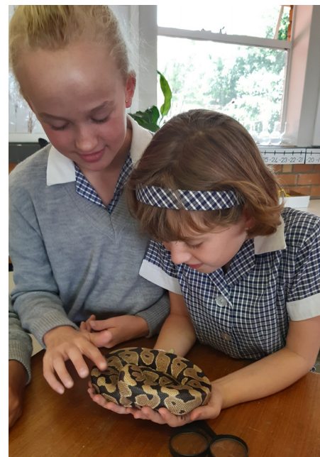
Discussing all things snakes