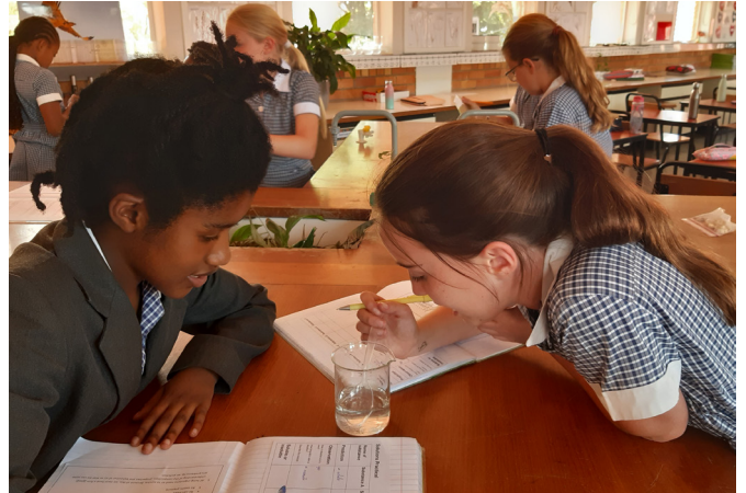
The solute dissolved easily