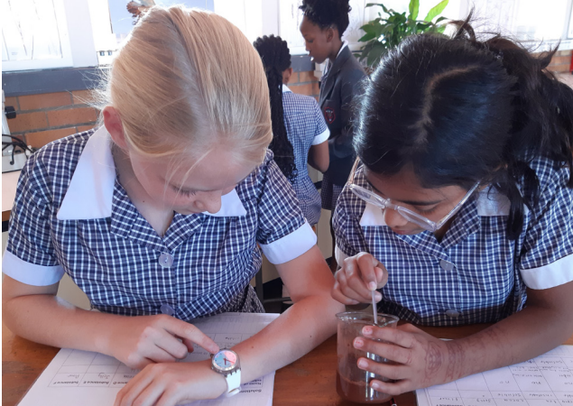
Timing the rate at which solubility is achieved