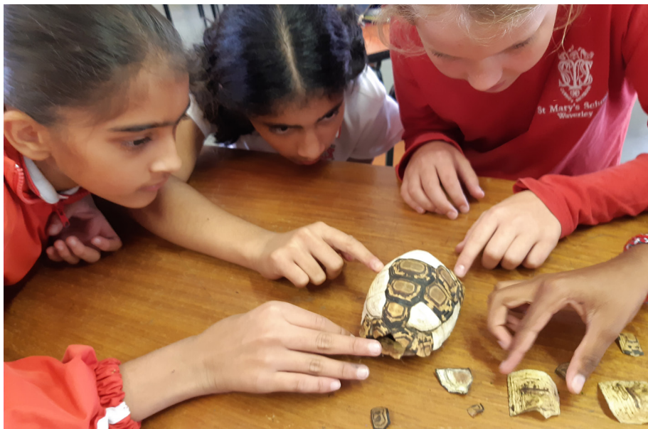
Fitting the rough scutes back onto a tortoise shell found in the bush